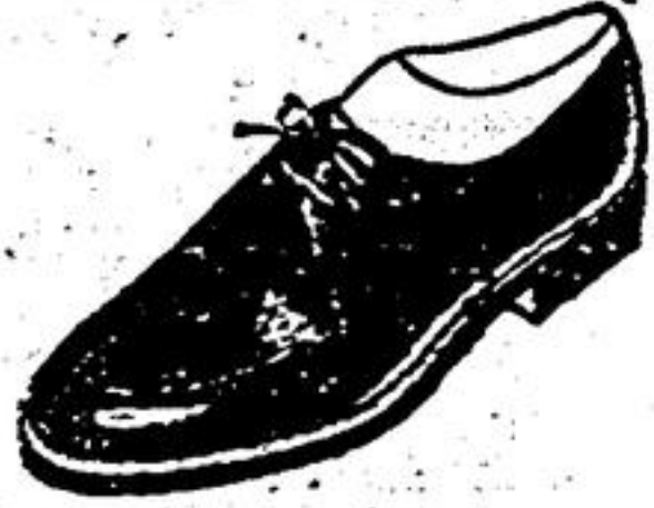
Priced at $9.95

Men's shoes step through the Easter holidays and into one of the most comfortable Springs in years! Come in and see our collection.