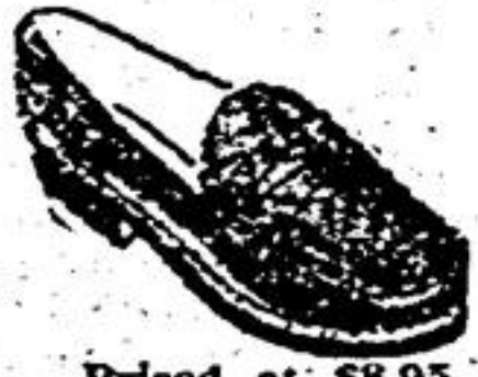
Priced at $8.95