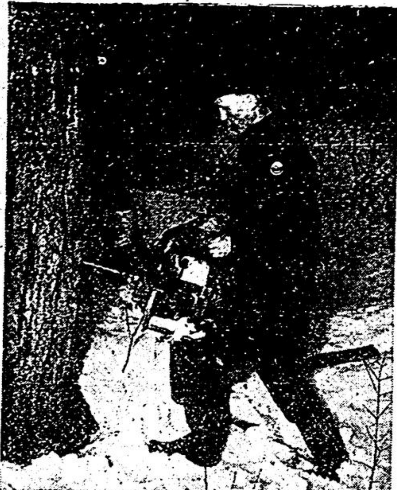
MODERN WRINKLE IN THE MAPLE BUSH—Power drill replaces Granddad's old brace-and-bit for tapping trees at maple syrup time near Vivian Forest, north Toronto, Ontario.