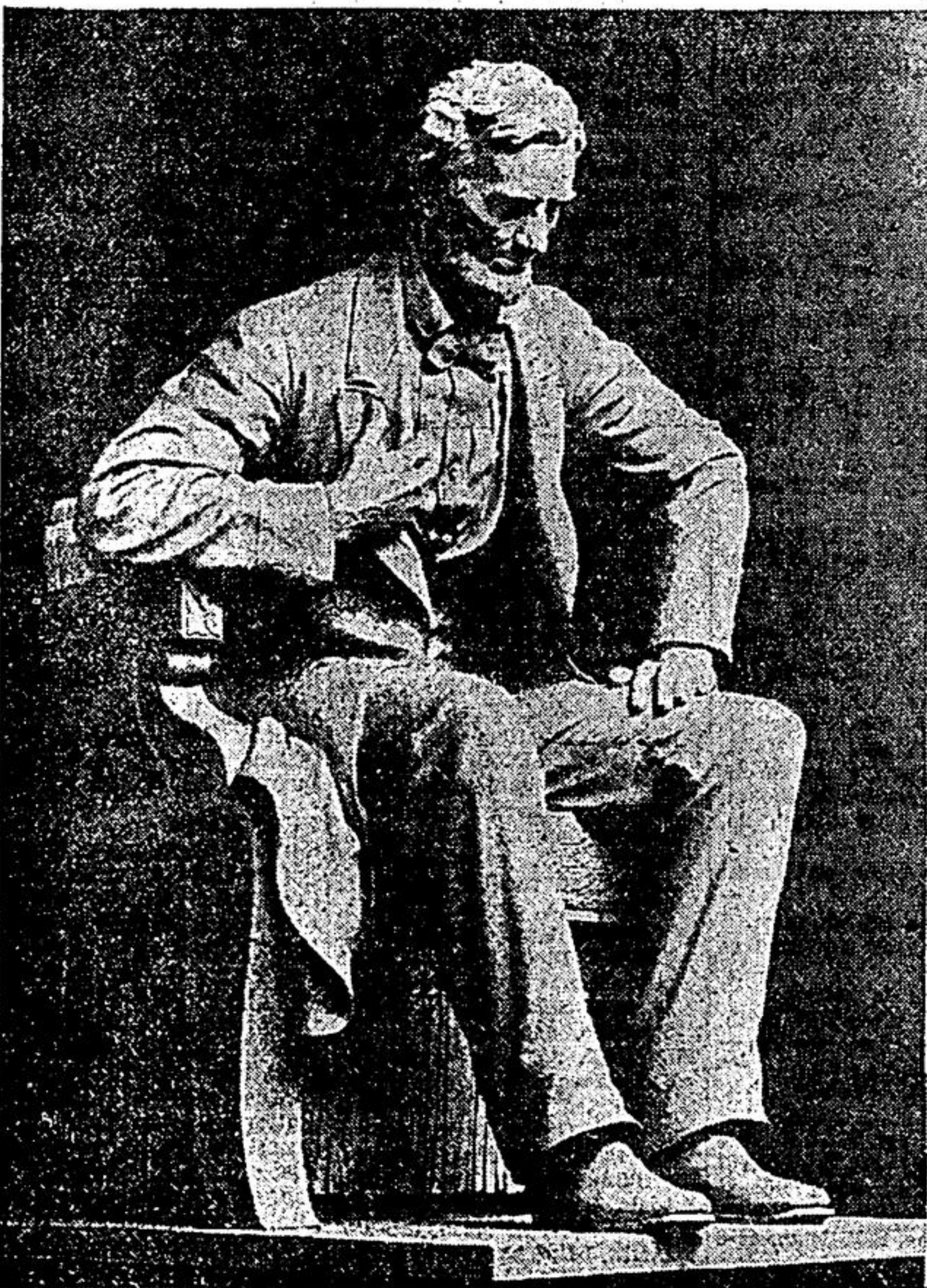
San Francisco—Lincoln holds lapel in pose reminiscent of Napoleon.

EVEN NOW , nearly 90 years after his death, Abraham Lincoln is still a puzzle to sculptors seeking to carve his many-sided personality into one all-embracing statue. Lincoln's character was so complex that new research constantly unearths new facts about him. Aside from religious figures, more probably has been written about him than any other person and, yet, no sculptor will probably ever produce the Lincoln statue. Here are some excellent, though different, ones.