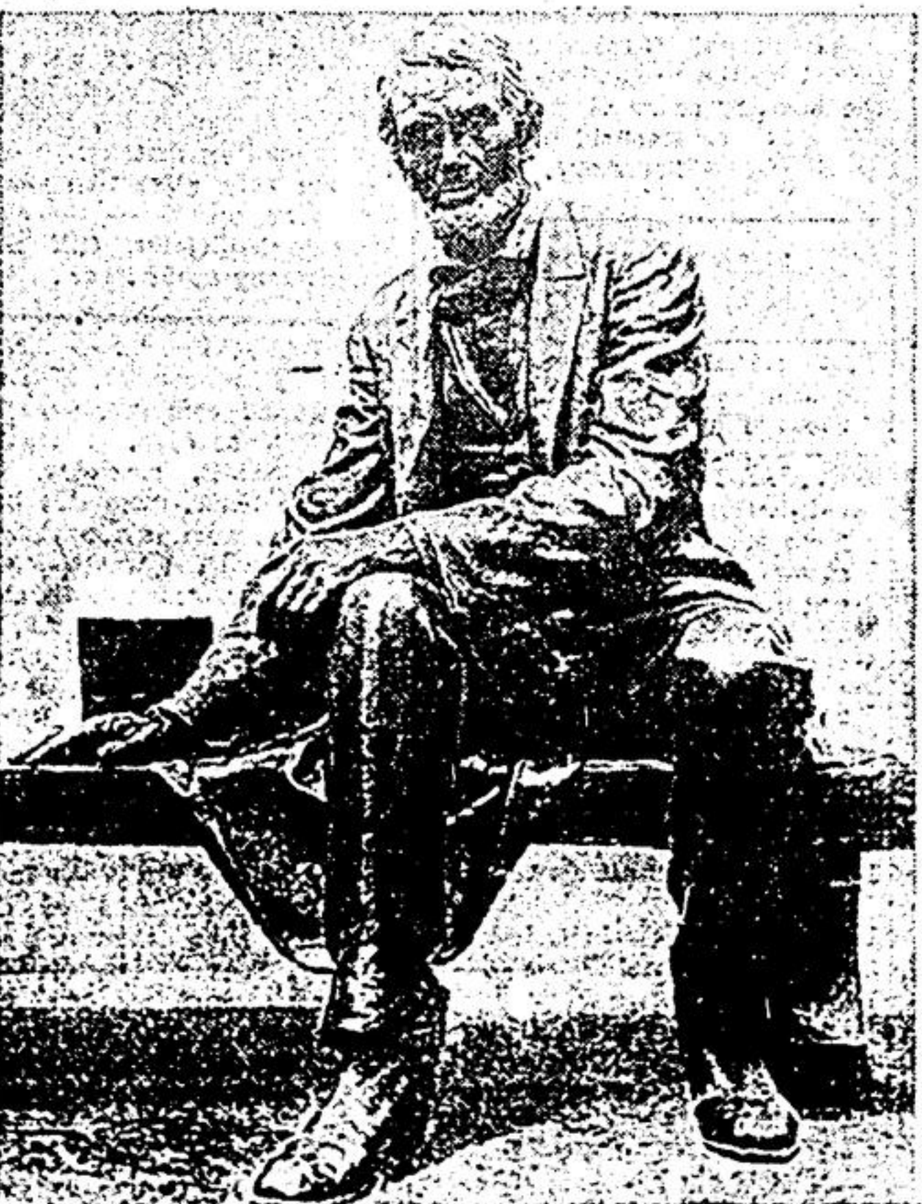
Newark—Philosophic Lincoln meditates on park bench.