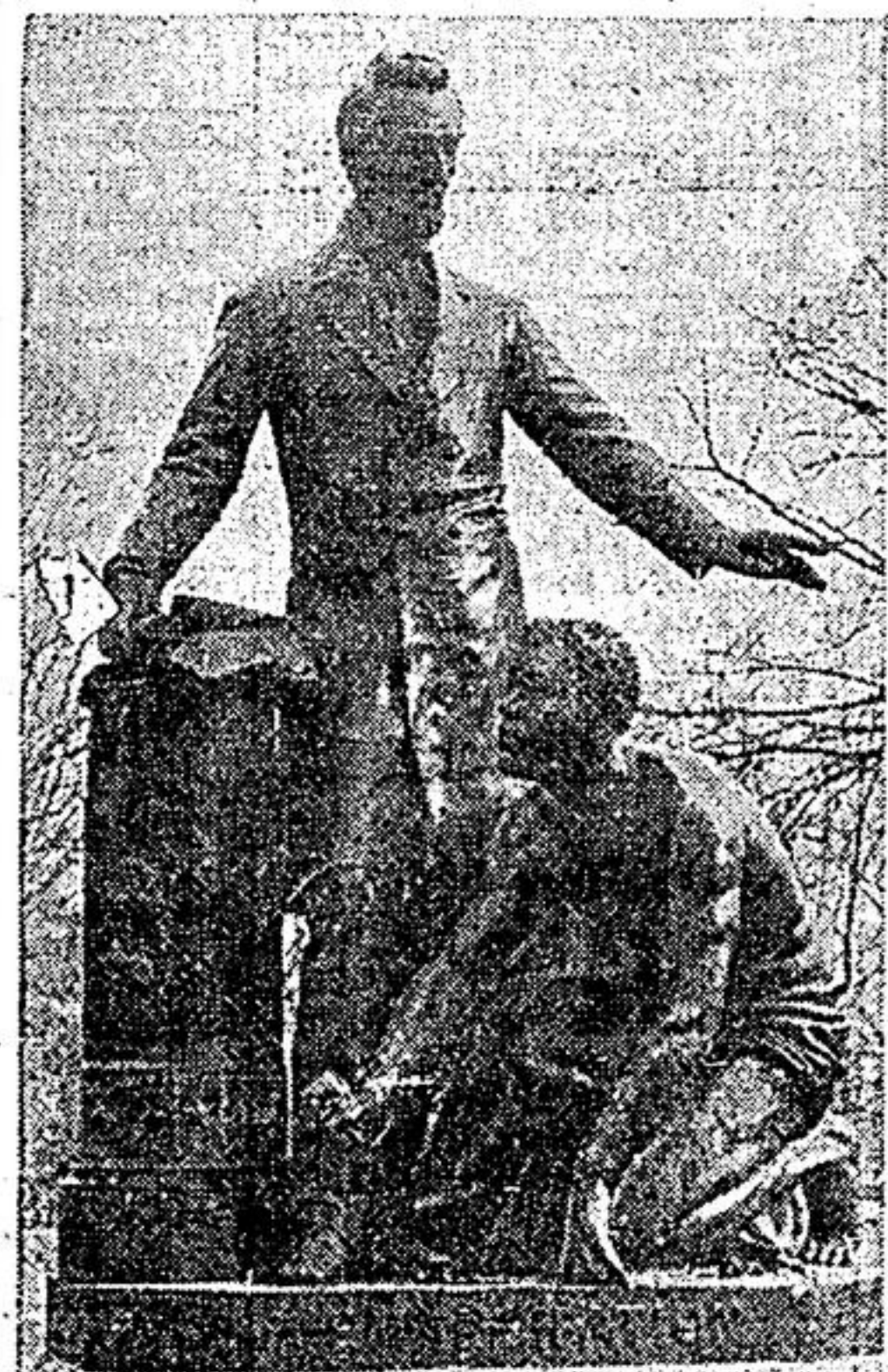
Washington—Great Emancipator frees slave.

EVEN NOW , nearly 90 years after his death, Abraham Lincoln is still a puzzle to sculptors seeking to carve his many-sided personality into one all-embracing statue. Lincoln's character was so complex that new research constantly unearths new facts about him. Aside from religious figures, more probably has been written about him than any other person and, yet, no sculptor will probably ever produce the Lincoln statue. Here are some excellent, though different, ones.