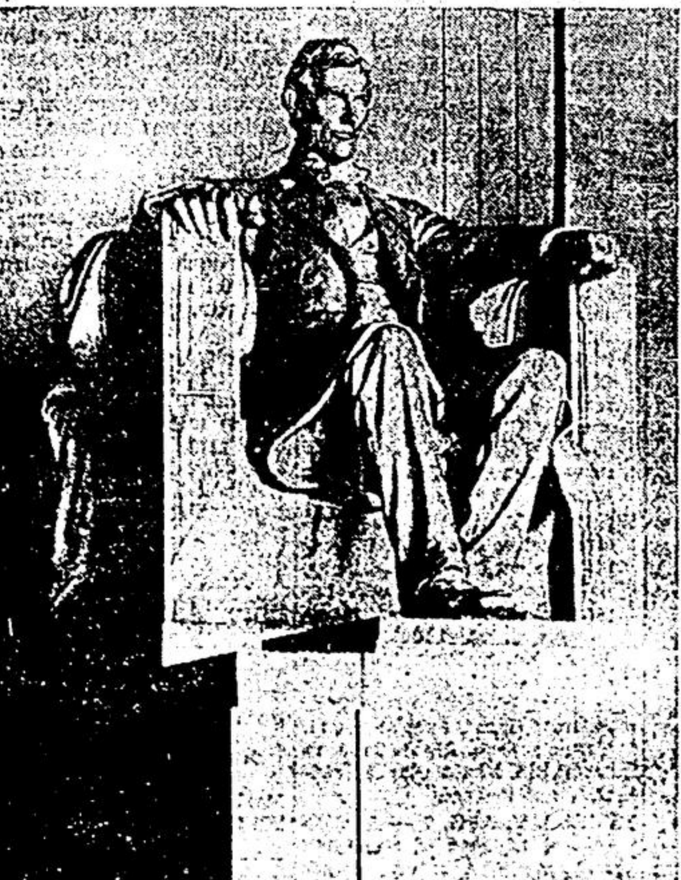
Washington—Famous Lincoln shrine attracts millions.