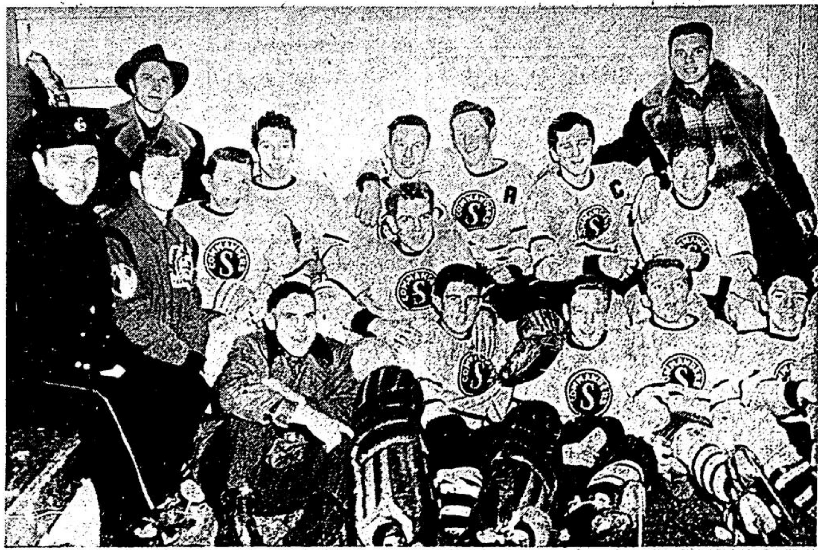
The Stouffville Commanders, one of the finest Midget teams to be organized here for many years, came to the end of the playoff road on Monday night after reaching

the Ontario semi-finals. The team is pictured in the dressing room after the final contest in their two game total goal series with Cannington. From left to right (rear) —