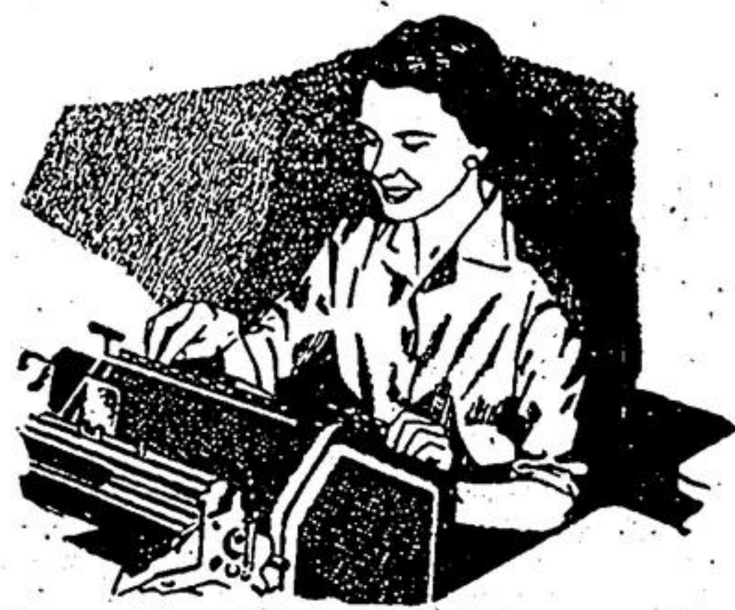
Modern machines help bank staffs keep up with greater use of services by more and more customers.

Today Canadians have 9,200,000 deposit accounts in the chartered banks—3,800,000 opened in the past ten years. Within the same period, branches have increased to 4,000; bank staffs have almost doubled to more than 50,000. Banking has grown in size and scope, continually adapting its services and improving its methods of operation, keeping pace with the greatly-increased banking requirements of the Canadian people.