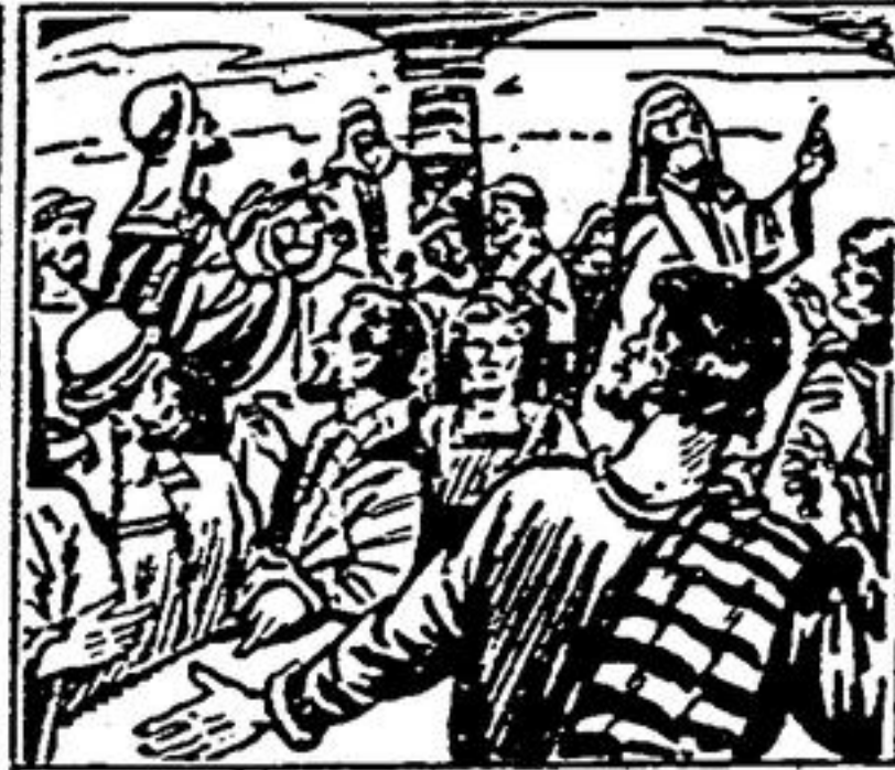
When the Holy Ghost fell on the disciples, they talked strangely, seeming to be drunk. Peter, standing with them, told the people to listen to his words.