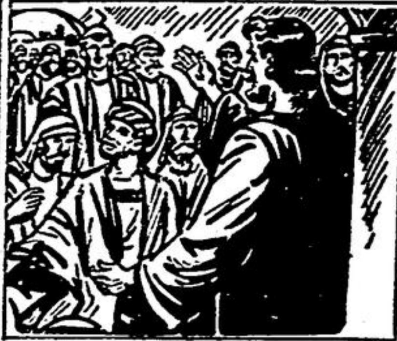
Then Peter talked of Jesus whom they had crucified but who was raised from the dead, and he called upon his hearers to repent and be baptized.