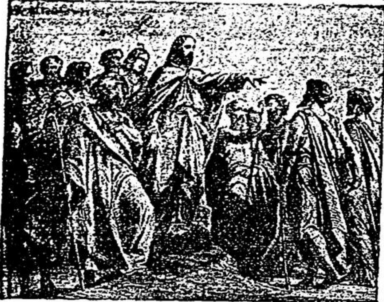
Jesus appoints the twelve.

"For I am not ashamed of the gospel of Christ; for it is the power of God unto salvation to every one that believeth; to the Jew first, and also to the Greek."—Romans 1:16.