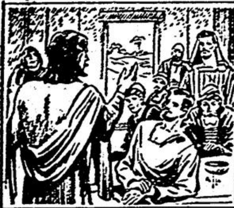
Jesus appeared to His eleven disciples and gave them His command, that they should go into the world and preach the gospel to all creation.

Scripture—Mark 16:15; Acts 2:14-41; Romans 10:8-15; 1 Corinthians 1:18-25; Colossians 1:24-29.