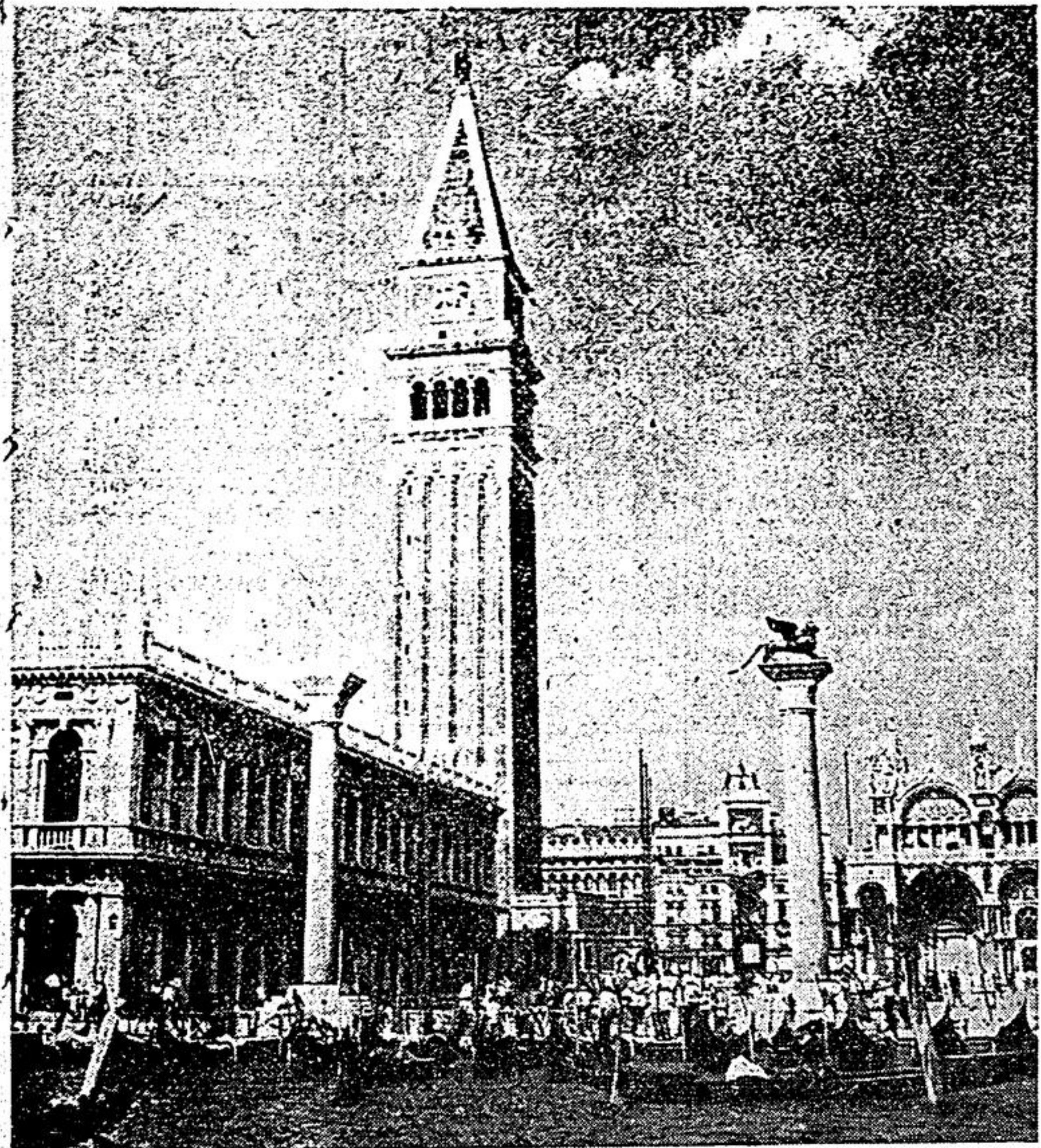
YOU CAN'T take a gondola ride through Venice right now, but come along with the cameraman for a quick trip. You're looking at Piazzetta San Marco. At left is the Libreria Vecchia, built in 1536. Rising high is the Campanile and in the far background, framed by Campanile and column with winged lion, is famous clock tower.