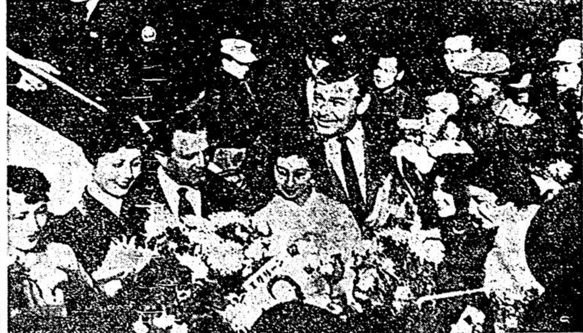
STILL "THE KING" in Japan, actor Clark Gable is surrounded by actresses and fans when he arrives in Tokyo. Gable's en route to Hong Kong for soldier of fortune movie.