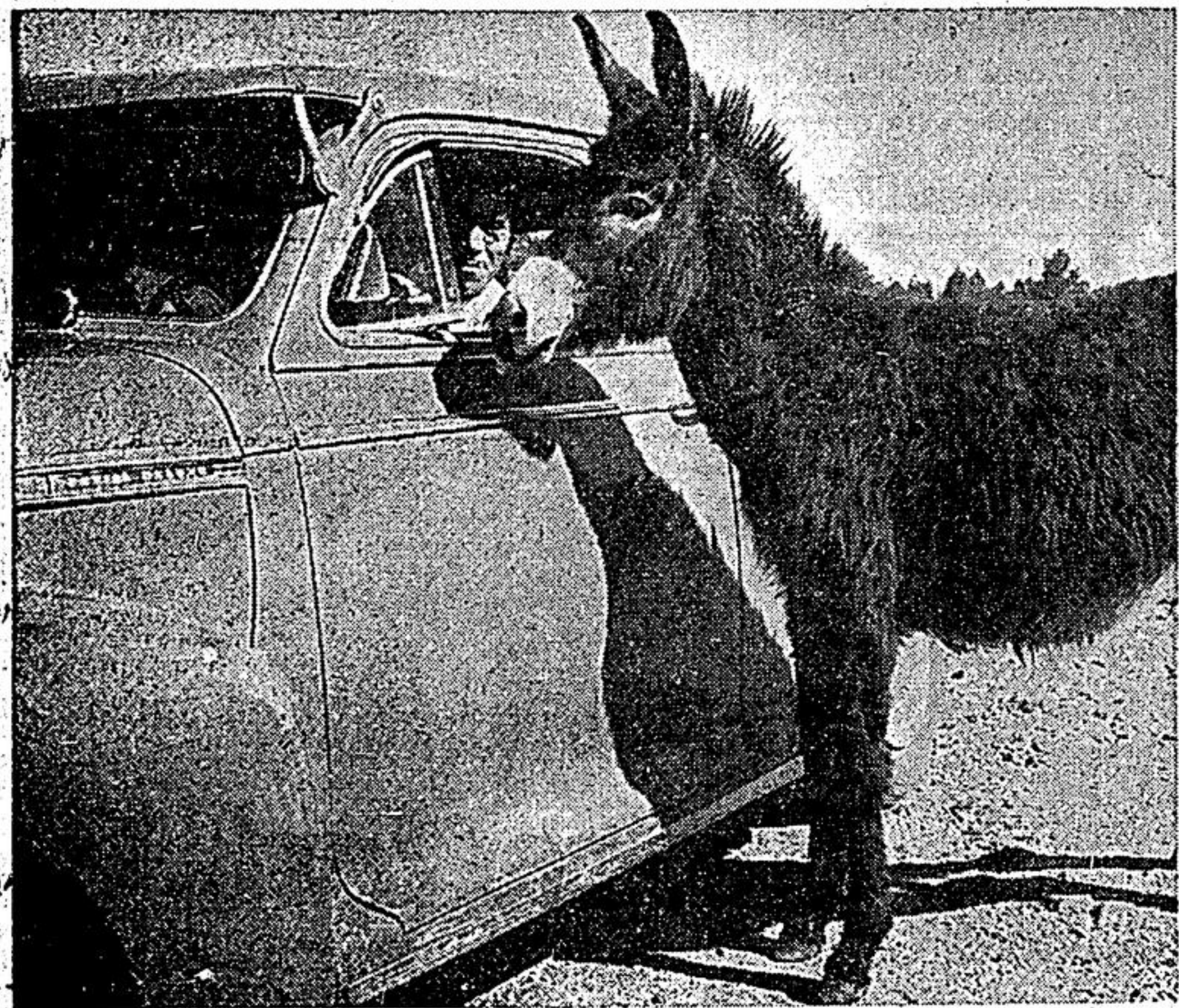
PANHANDLER DELUXE is this mountain burro, who stops everyone coming up the Iron Mountain road leading to Mt. Rushmore in South Dakota. He'll get a morsel here.