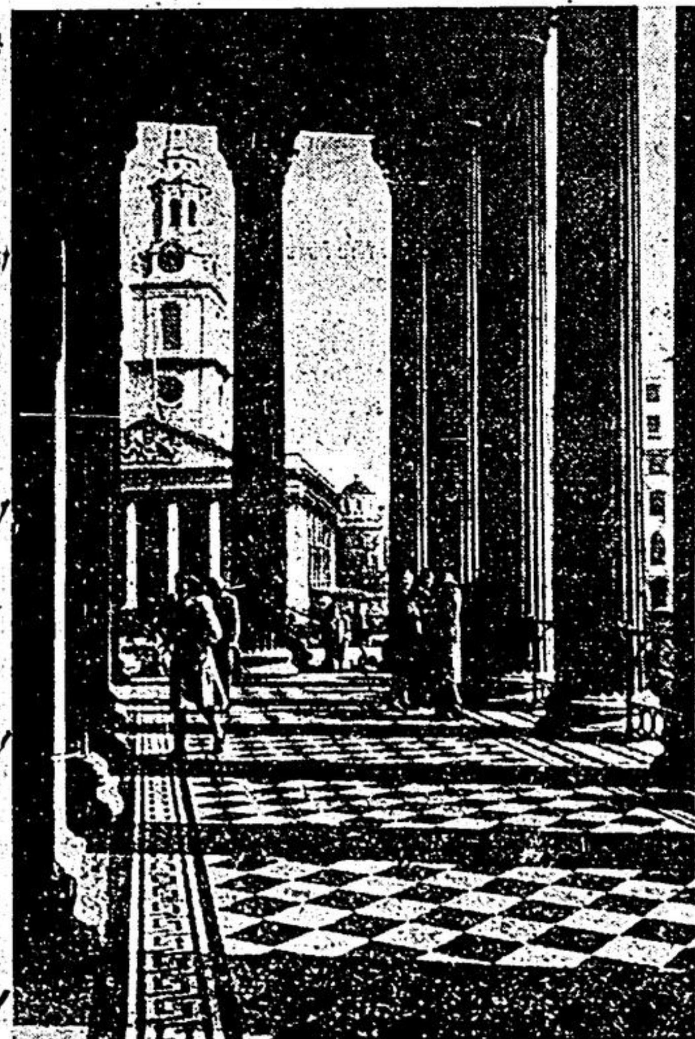
LONDON'S famous picture galleries in Trafalgar Square, with the church of St. Martin-in-the-Fields in the background, will attract many tourists during winter season.