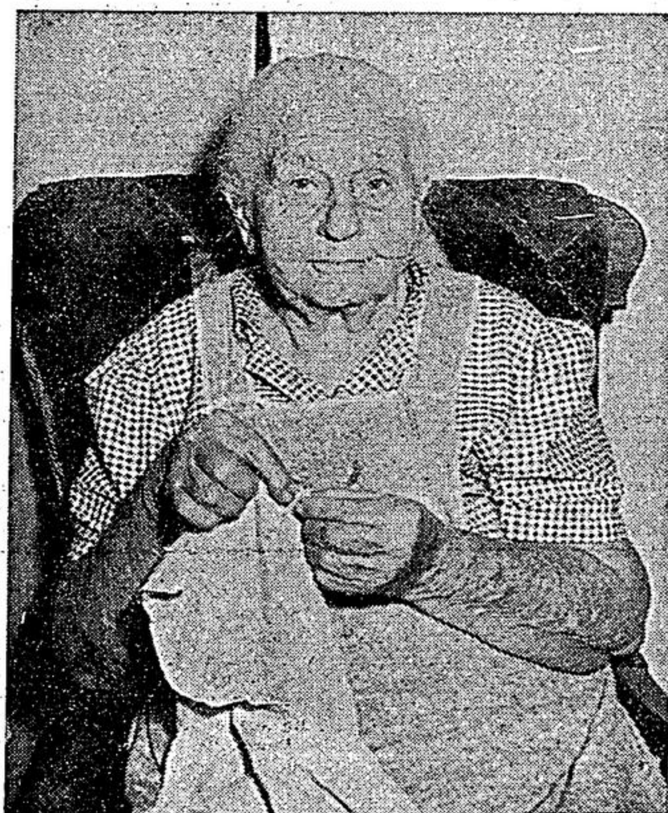
Sews Without Glasses at 98