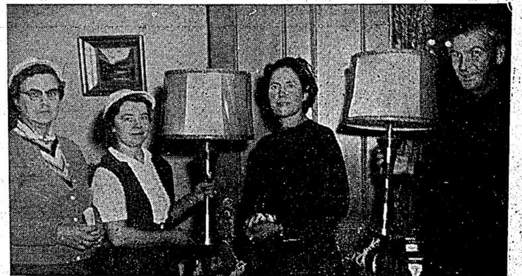
Presentation to Ontario Lady Bowling Champ