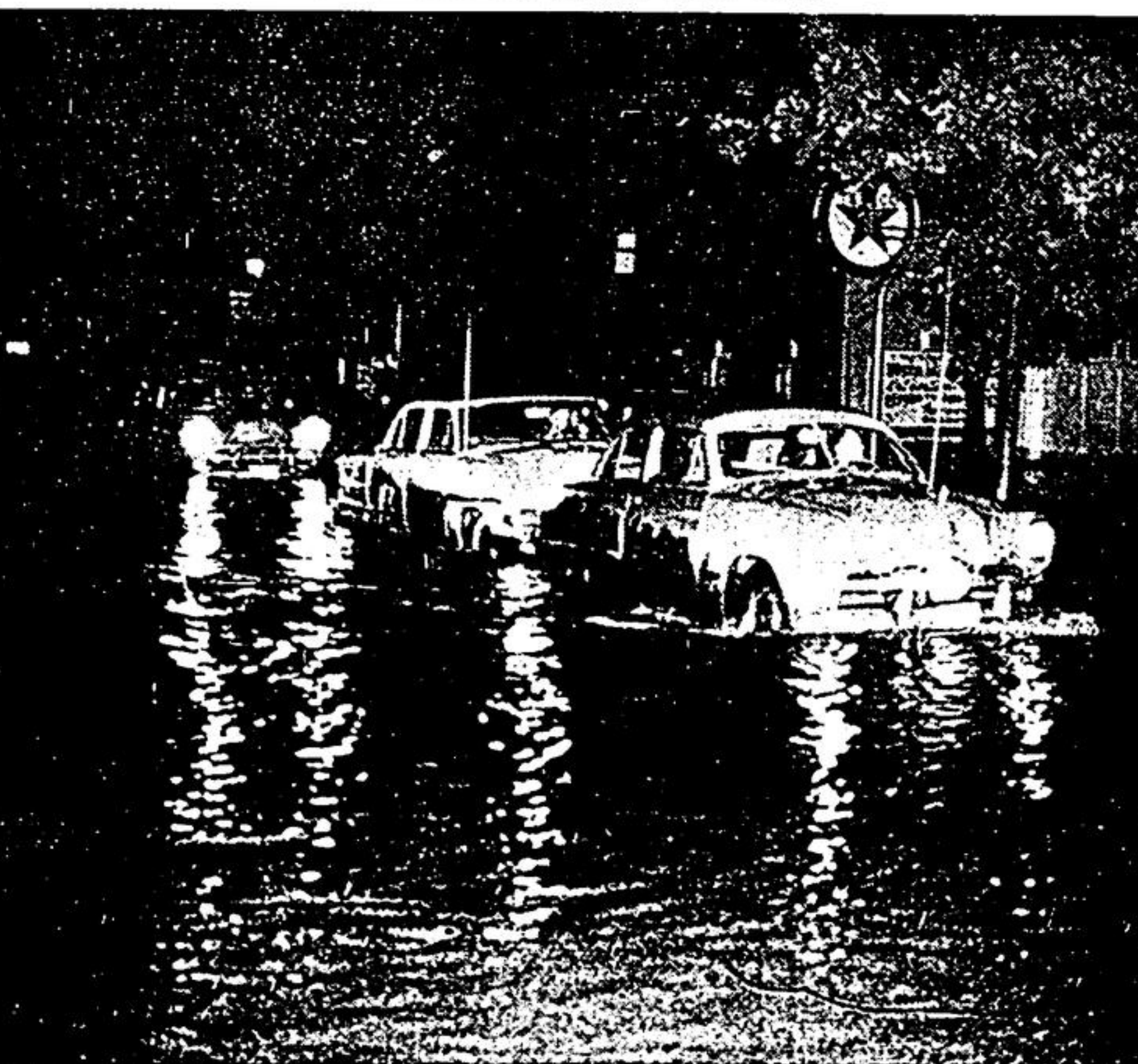
Main Street During Hurricane Hazel