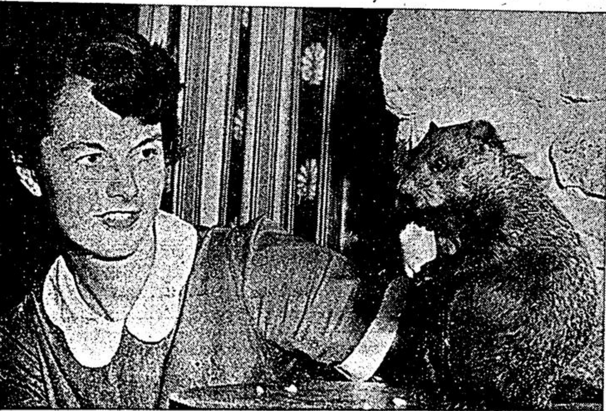
Pet Woodchuck at Shadow Lake Camp