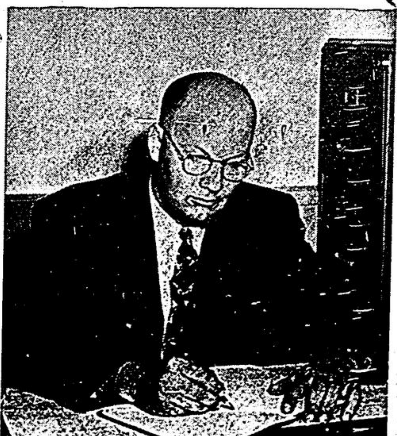
New High School Principal