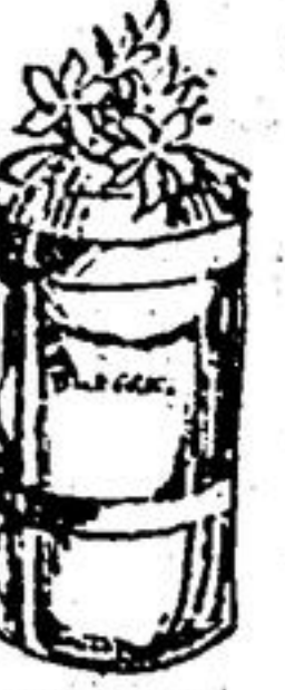
Blue Grass Bath Soap—3 cakes in flowered acetate tube, $3.00