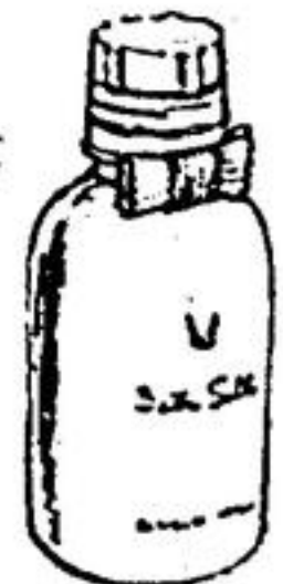
Blue Grass Ivory Bath Soap—concentrated, $6.00