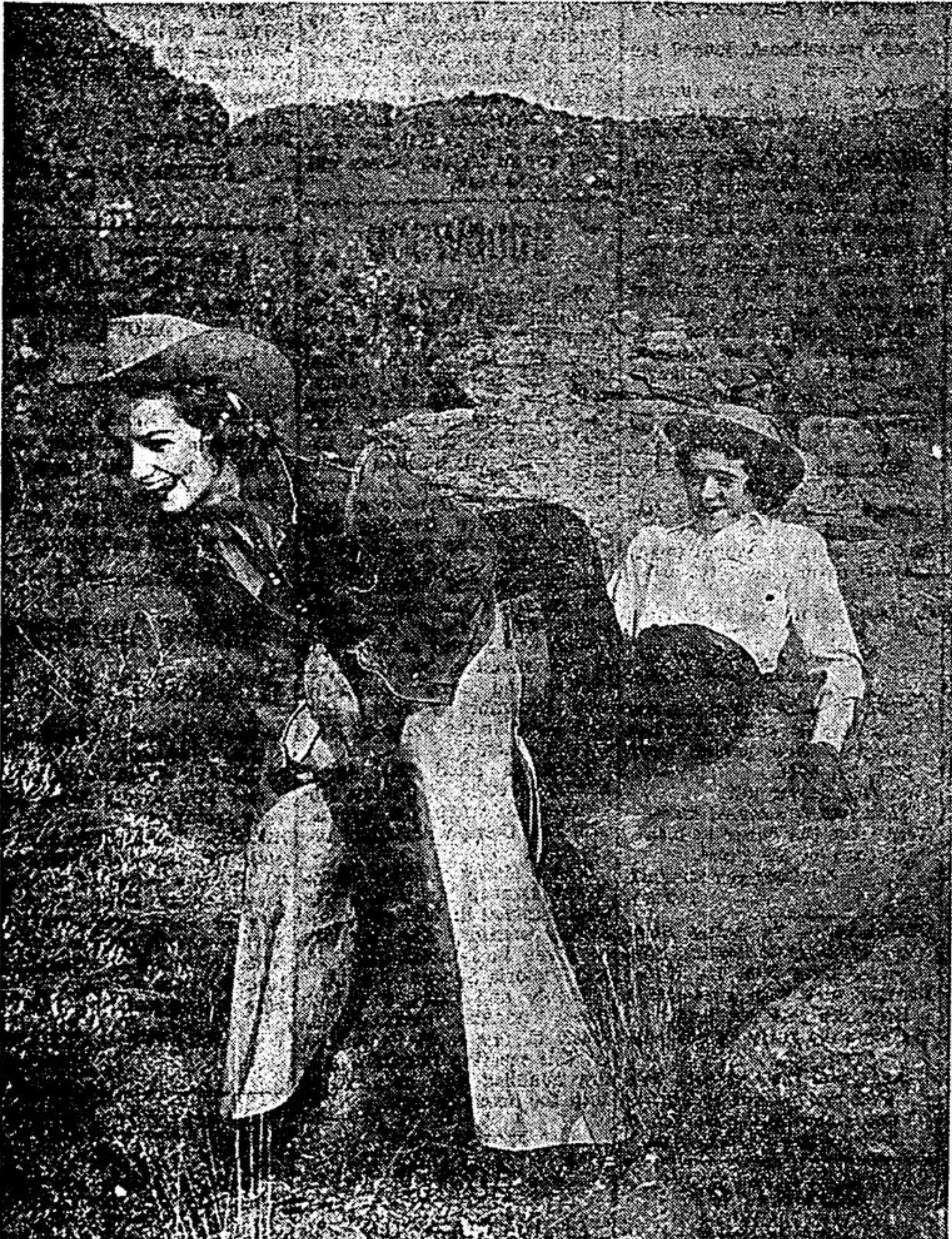
TAKES A LOT of pull to get a pair of boots off around here. These two Tucson, Ariz., cowgirls team up to remove boots. Ungallant photographer stood by without offering help.