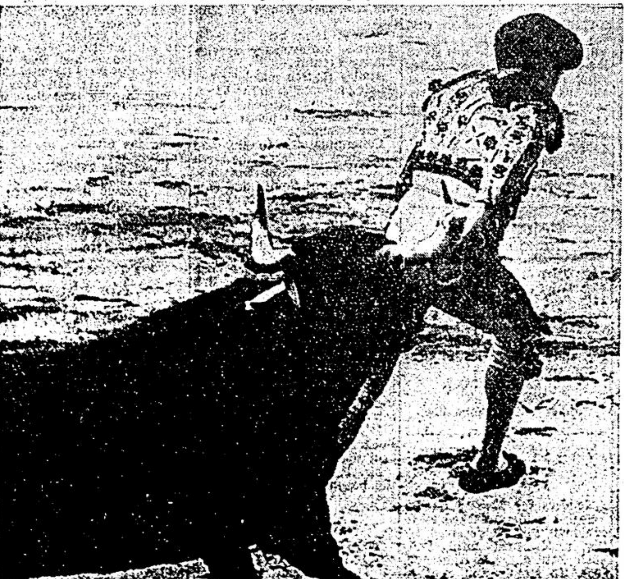
A TOUCH OF COMEDY sometimes enters into the serious business of bullfighting. This banderillero has just finished his job of planting a few darts in the bull to get him angry, but he didn't get out of the way fast enough and the bull gets in a jab at his tormentor. The bull has one horn hooked through the seat of the man's pants in Madrid bullring.