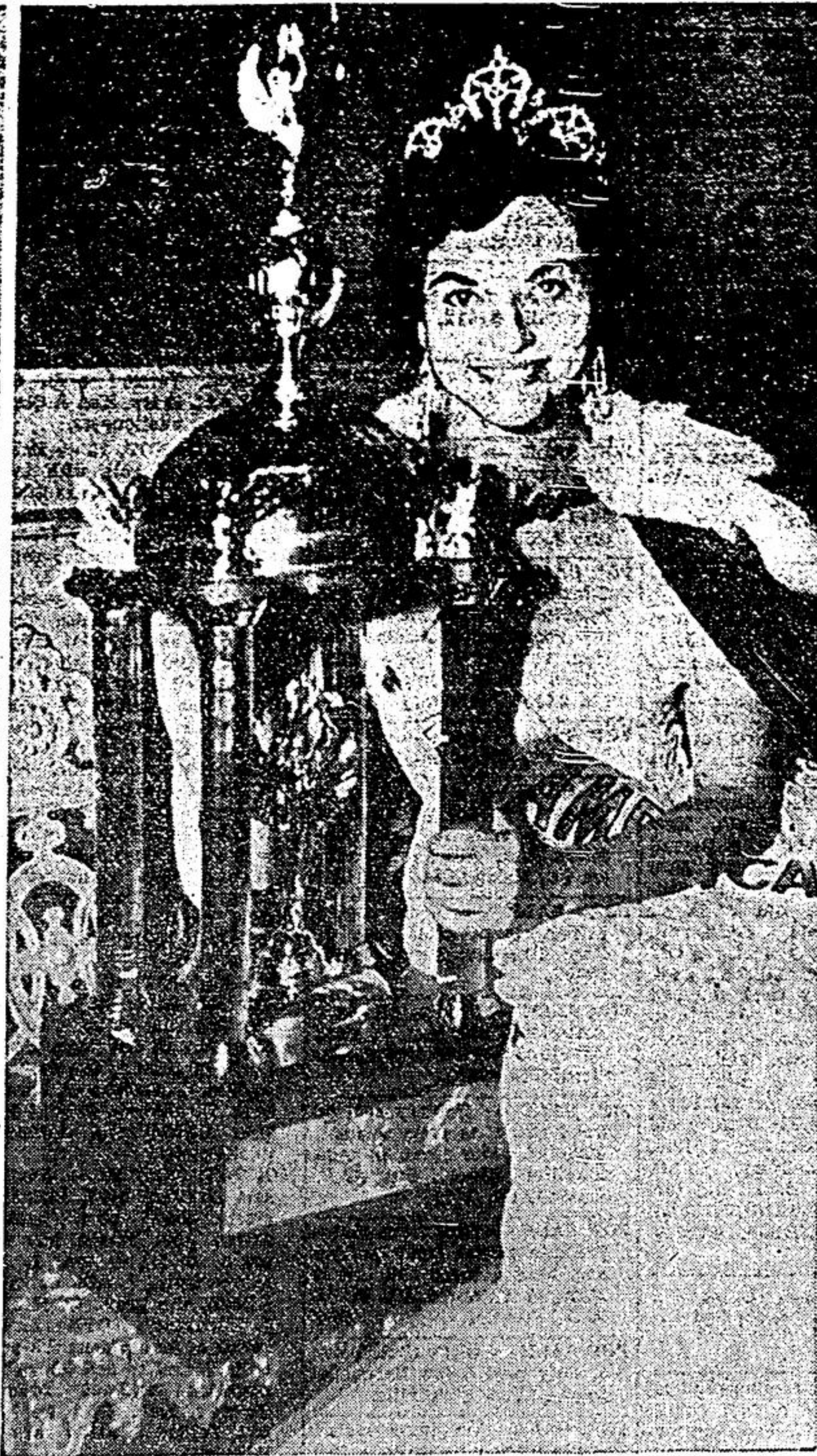
LOVELIEST GIRL in United States, Lee Ann Meriwether, holds the trophy she won at Atlantic City as Miss America of 1955. A sophomore at the City College of San Francisco, she will use scholarship award for acting career. America's most talented and beautiful girl entered as Miss California.