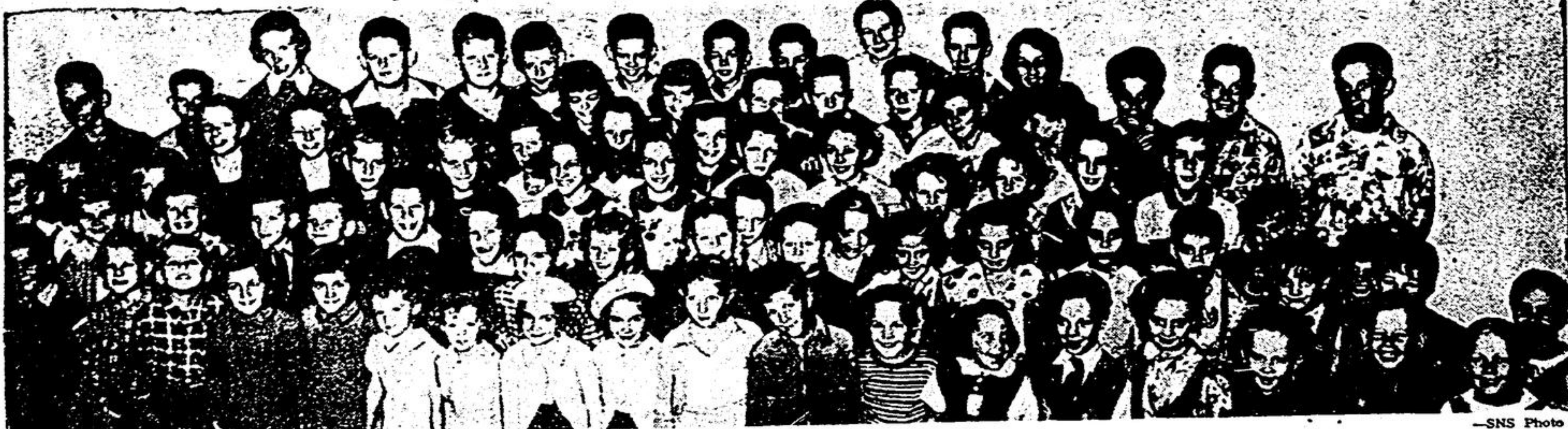
Representing double trouble to public school teachers at Guelph, Ont., schools are these 38 sets of identical twins. Most of the twins are between five to 10 years old—the hardest age group for teachers to identify, as their personalities have not as yet diverged. Although the harassed teachers have devised such tricks as giving each twin a different colored scarf to wear, the youngsters usually swap scarfs to further confuse the issue.