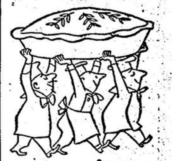
Apple pie... coming up