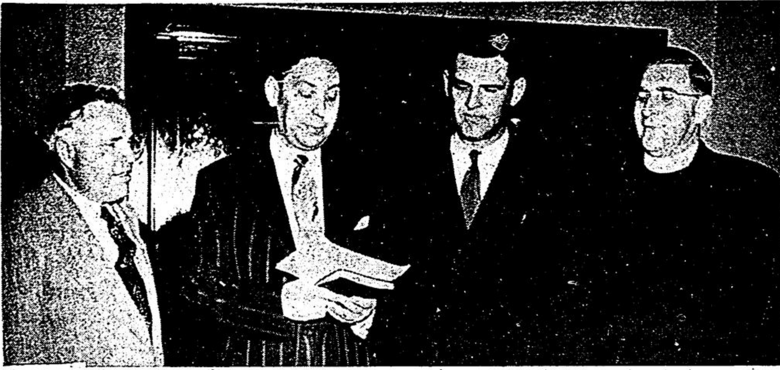
The annual United Missionary Church Convention completed its six day Conference at Gormley on Sunday. Pictured above from left to right are members of the executive...