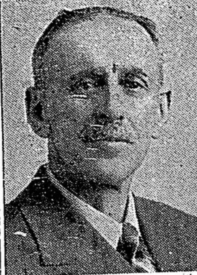
He has been residing in Blackstock about a year and a half.