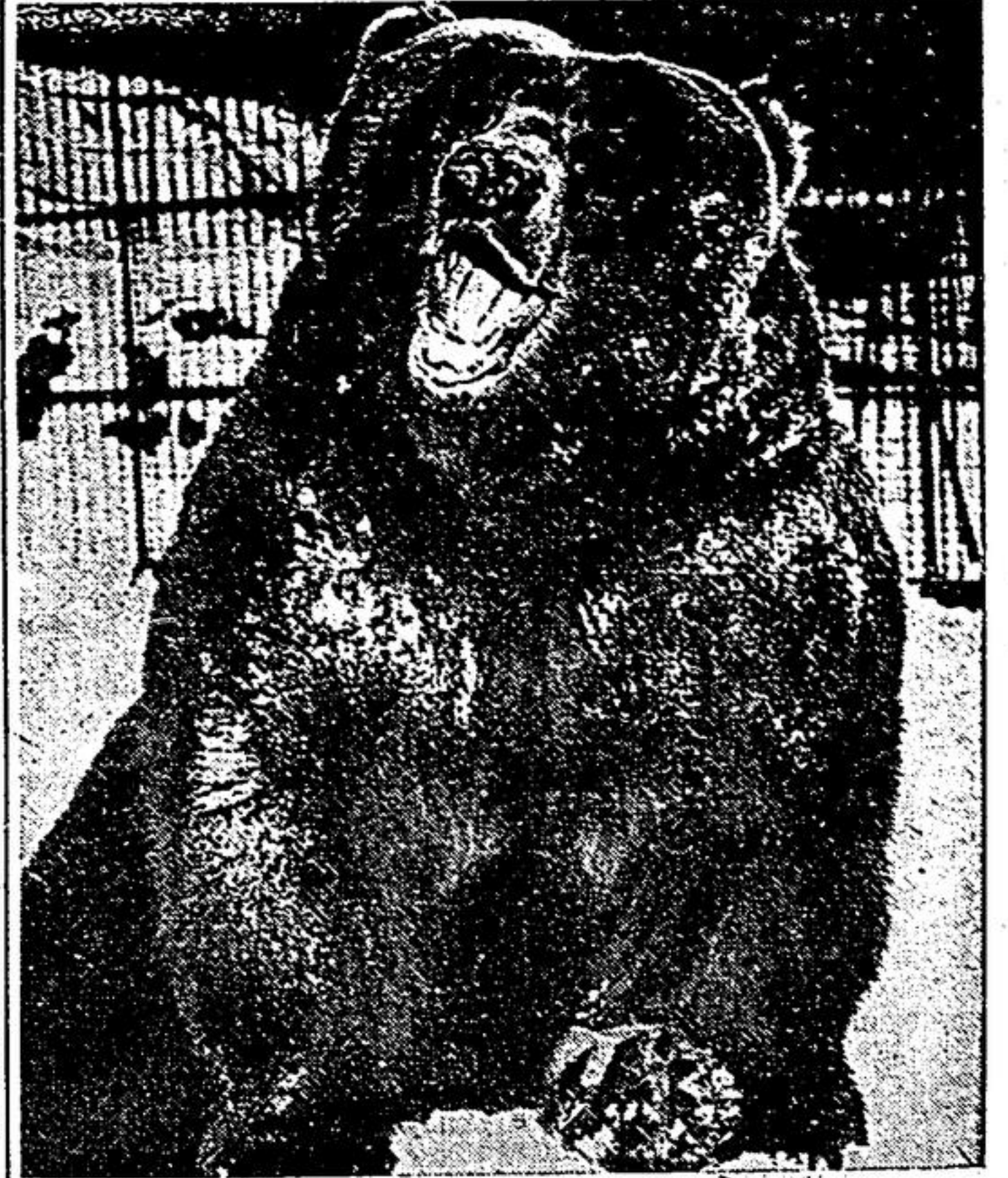
All you have to do to enjoy the cold and snow, as much as Jo Jo, the Kodiak bear of the Bronx Zoo, is to wear a huge fur coat. Jo Jo really enjoys life when the temperature is somewhere below zero and he probably wonders why the humans in front of him don't seem to be happy when it's snowing and blowing a gale. Jo Jo is a native of Alaska.