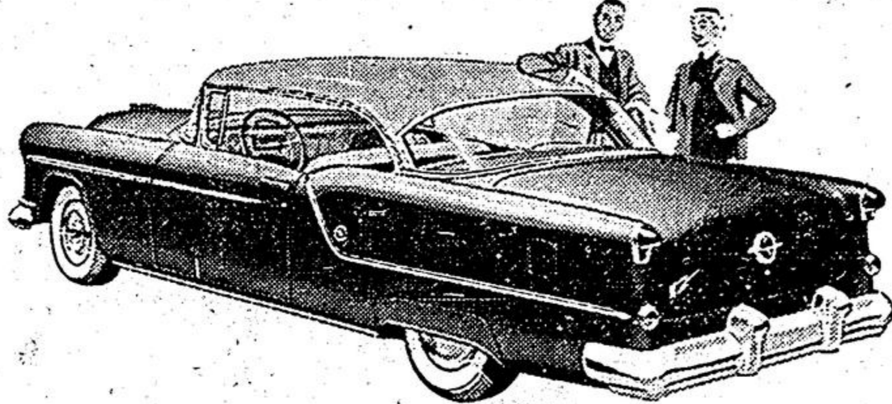
Car illustrated: 1954 Super "88" Holiday Coupé, A General Motors Value.

ANNOUNCING the breath-taking new Oldsmobile Super "88" for 1954! The Oldsmobile so ultra-new in design . . . so original in style throughout . . . there's never been a car like it before! Just wait till you see its new lower, longer, lovelier silhouette! The daring new slant of its panoramic windshield! The dramatic new flair in its sweep-cut doors and fenders! And just wait till you drive the new 185-horsepower World's Record "Rocket" Engine with 8.25 to 1 compression ratio—the engine that outperforms, and out-economizes even the power-famous '53 "Rocket". For a new view on modern automobiles—see the new Super "88". And watch for Oldsmobile's new "Dream Car"—the Classic Ninety-Eight . . . coming to your dealer's soon!