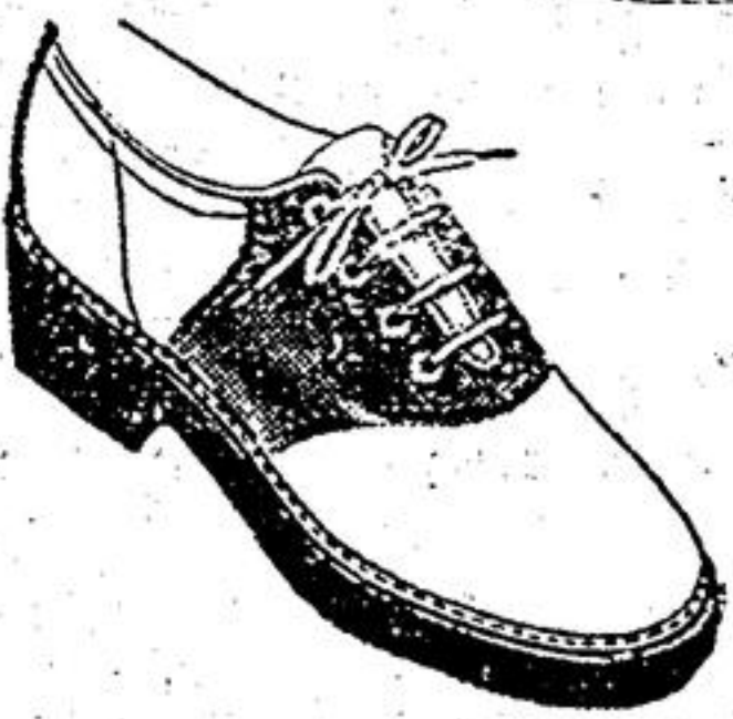
Saddle shoes with thick rubber soles. In blue with white.

Sturdy, long-wearing oxfords with wise and good-looking lines for comfort now and foot health in years to come.