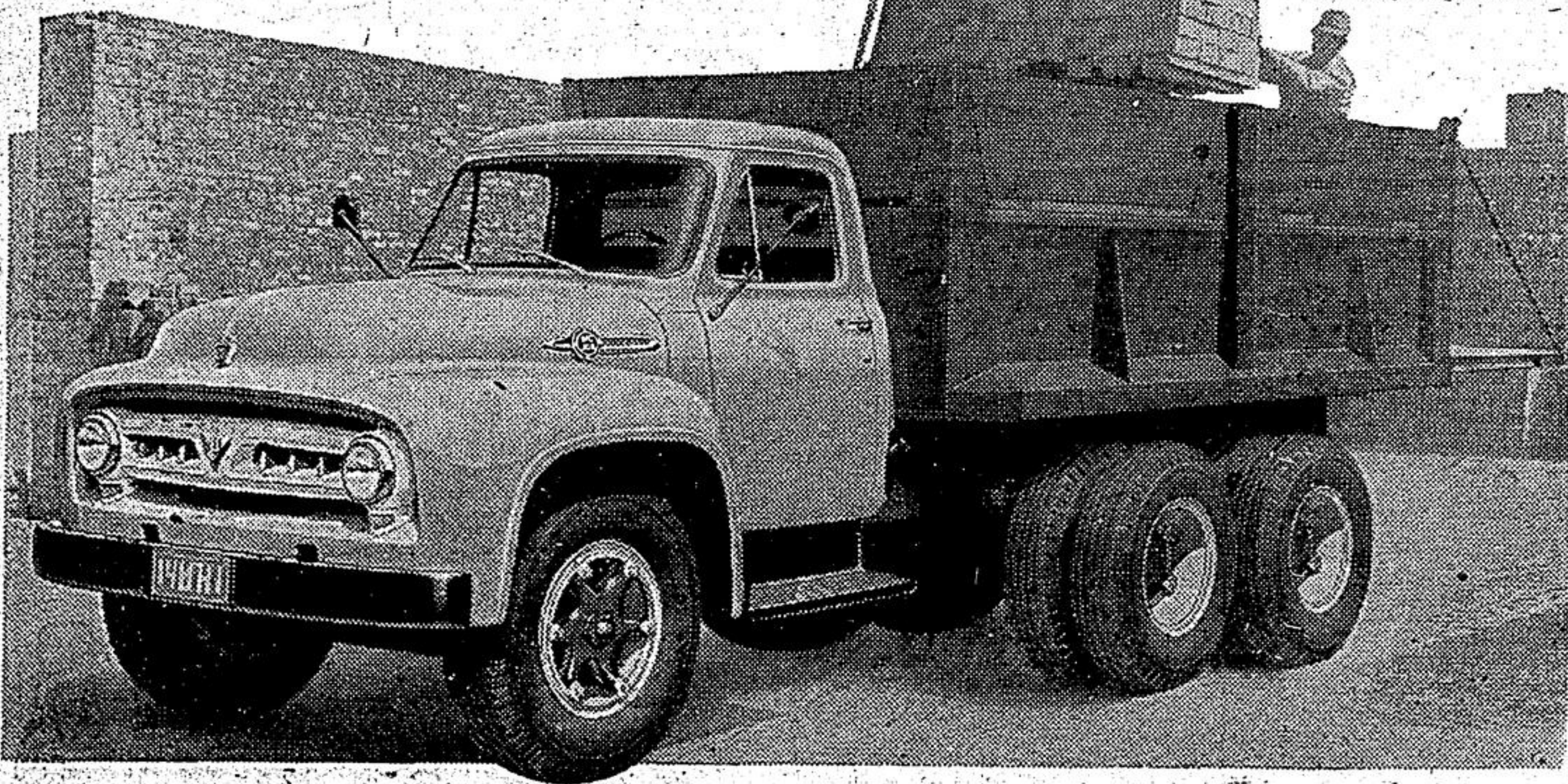
F-800 "BIG JOB"—a mighty giant of the Ford Truck line... G.V.W. ratings to 23,000 lbs.—G.C.W. ratings to 48,000 lbs., takes bodies from 7 1/2 to 19 feet... combines big power and big strength with big economy of operation.

For every kind of load, every kind of hauling job, you'll find the one right truck in the greatest Ford Truck line of all time... over 100 all-new models that are making trucking history on every road in Canada! Drivers everywhere are acclaiming the roominess, convenience and comfort of Driverized cabs... the mighty muscle-power of Ford's famous V-8 engines... the sweetest-ever handling ease that Ford's advanced engineering has built into every truck, from pickup to "big job"... the biggest choice of transmissions Ford has ever offered in any year! Contact your Ford Truck dealer... he has the truck to do your job more efficiently and economically than it's ever been done before!