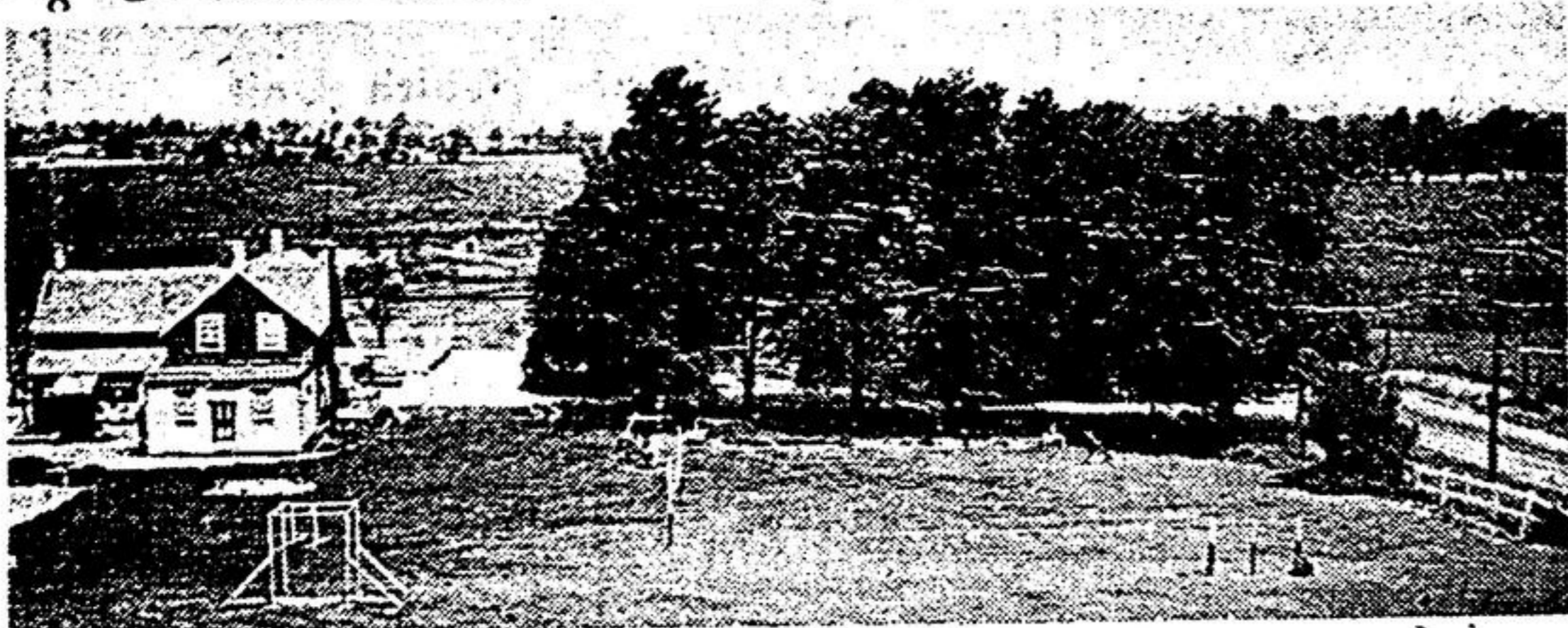
Here are "The Maples" located on No. 47 Highway north of Goodwood. Every amusement of youngsters is on the grounds.