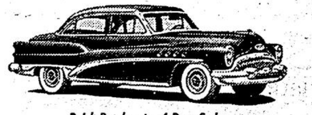
Buick Roadmaster 4-Door Sedan

*Standard on Roadmaster, optional at extra cost on other Series.