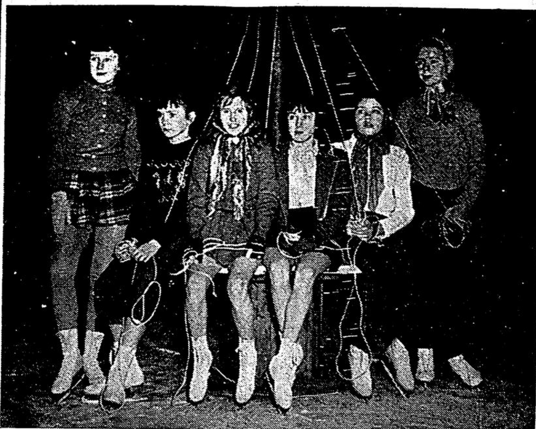
Stouffville Skating Club Ice Revue in the Arena on April 10th. will feature some clever springtime numbers, lovely costumes