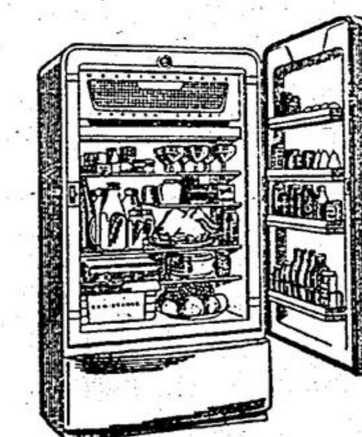
$330.00 WESTINGHOUSE MODEL WD-8 Has big full-width Freeze Chest with famous Colder Cold for fast freezing, safe storage. Features Humidrawer . . . Stor-Dor distinctive 3-way Handle and Triplok Latch.