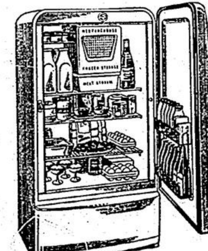
$200.00 WESTINGHOUSE MODEL SD-8 Has all the features you need and use every day. Frozen Storage Compartment . . . Meat Storage Tray . . . Stor-Dor Easy-to-Clean Removable Shelves . . . 3-Way Handle and Triplok Latch. Room for 8 qts. of milk and space for taller bottles too right where they chill quickly beside the Frozen Storage area. The perfect refrigerator for the value-wise family.