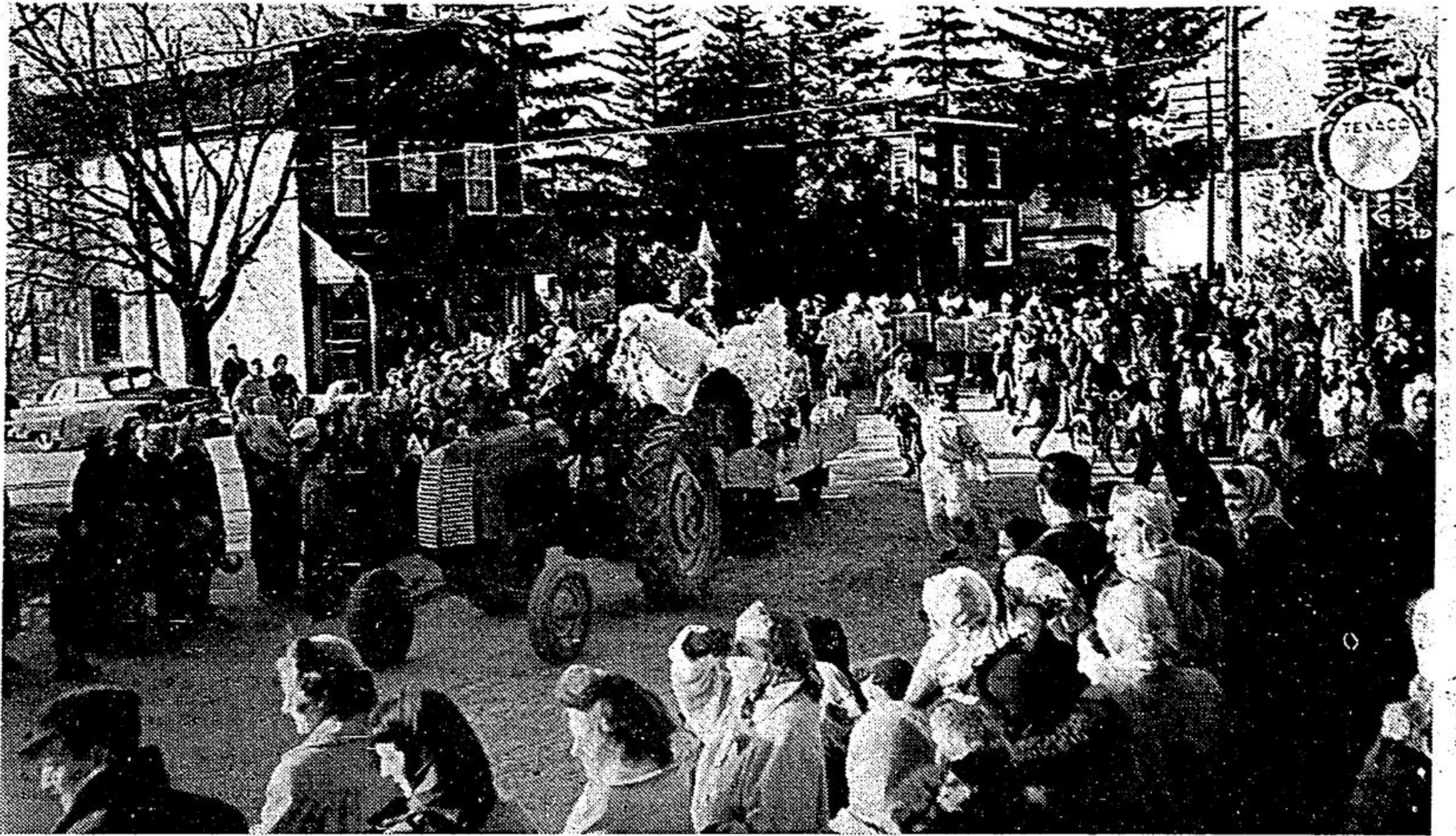
Here comes the first of more than two dozen floats in the