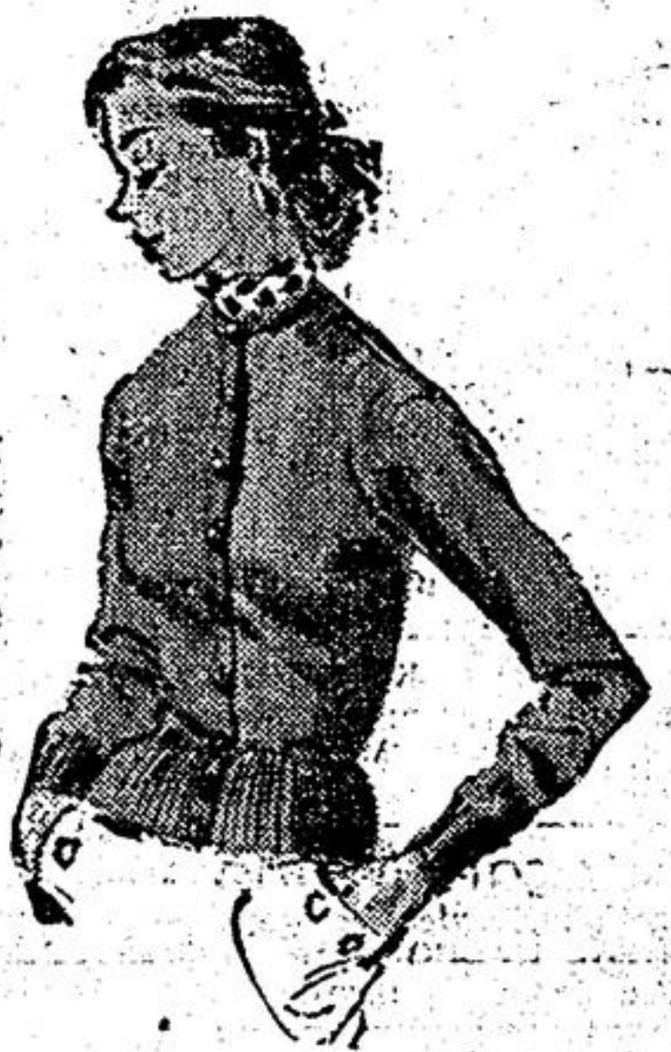
Classic cardigan style, long sleeved, color-matched front buttons. "Fairy Princess" by Monarch or "Cashmere Finish" by Regent Knit.