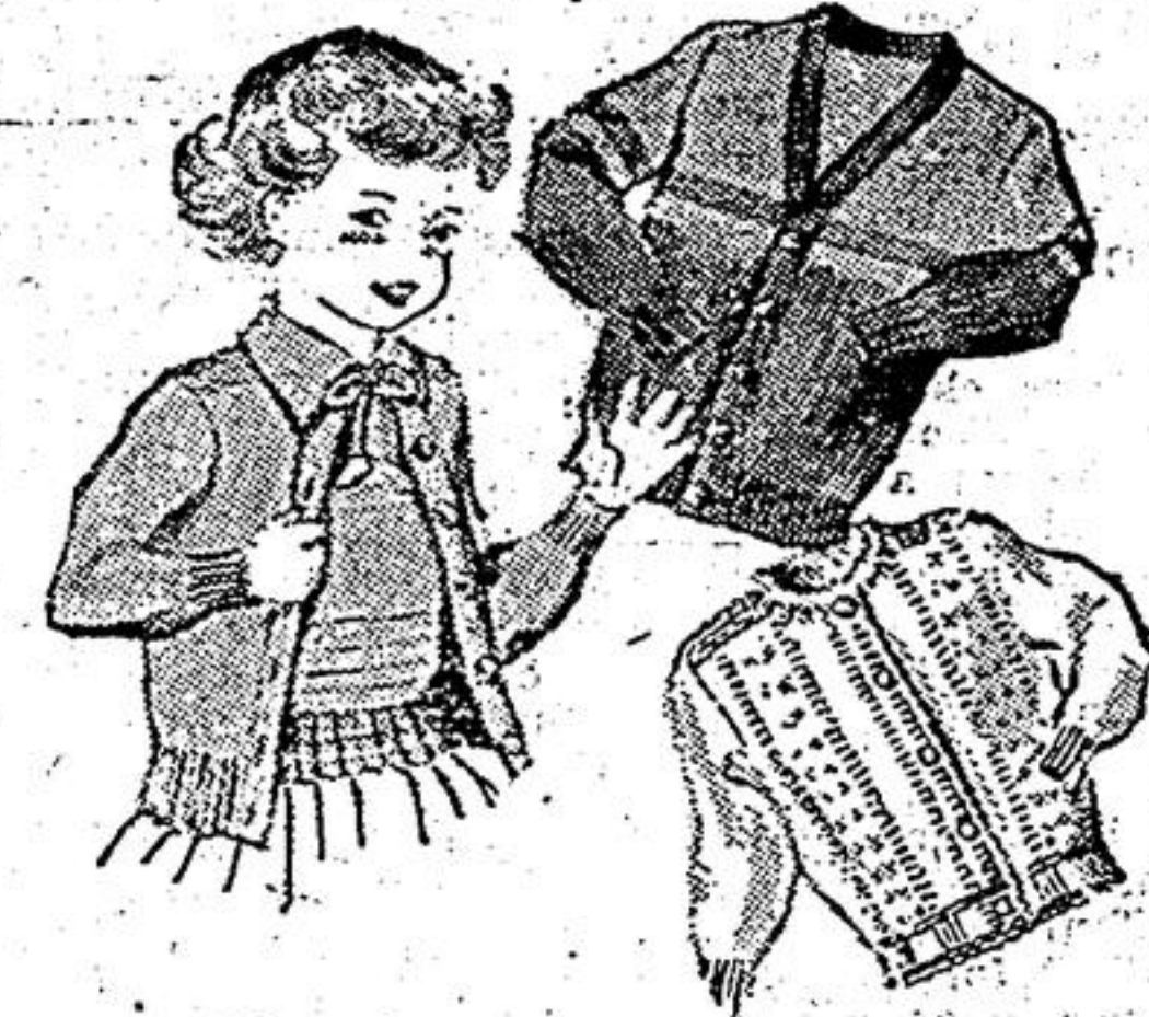
It's a fluffy armload of kitten-soft wools... in a wealth of new styles, textures and colors... bold and textured. Everything you'll want for casual or dress-up wear!