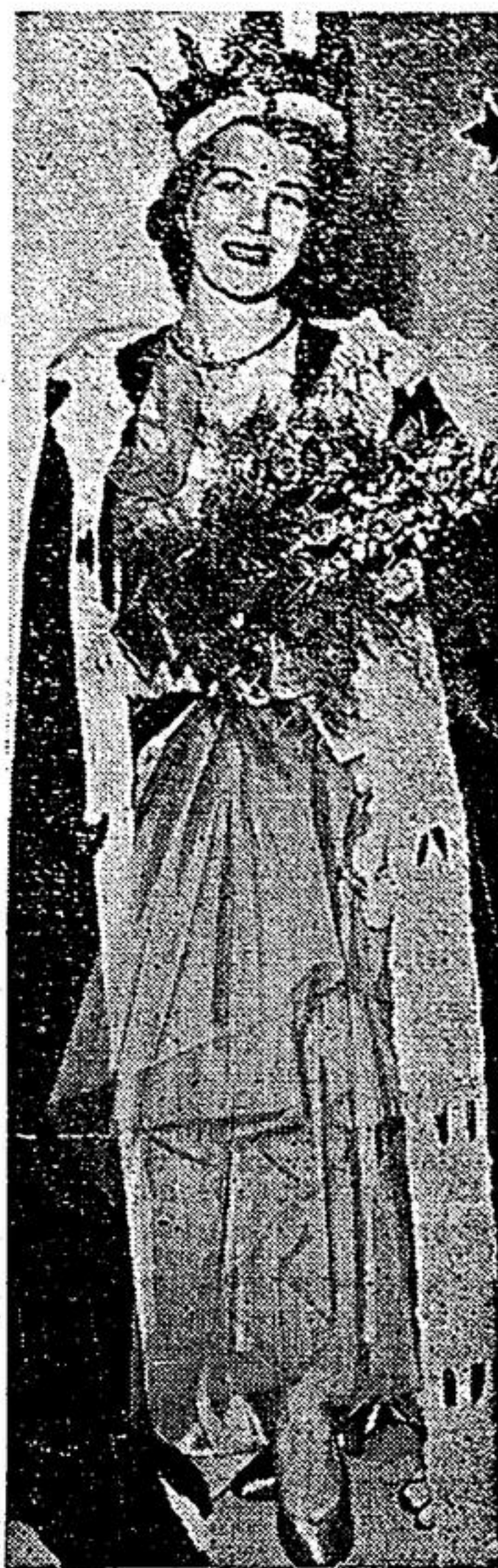
MISS CANADA, 1952