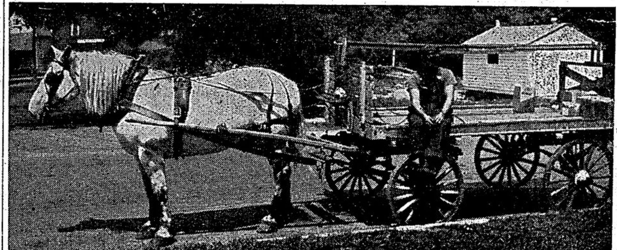
Cadieux C.N.R. Express wagon saw service here many years