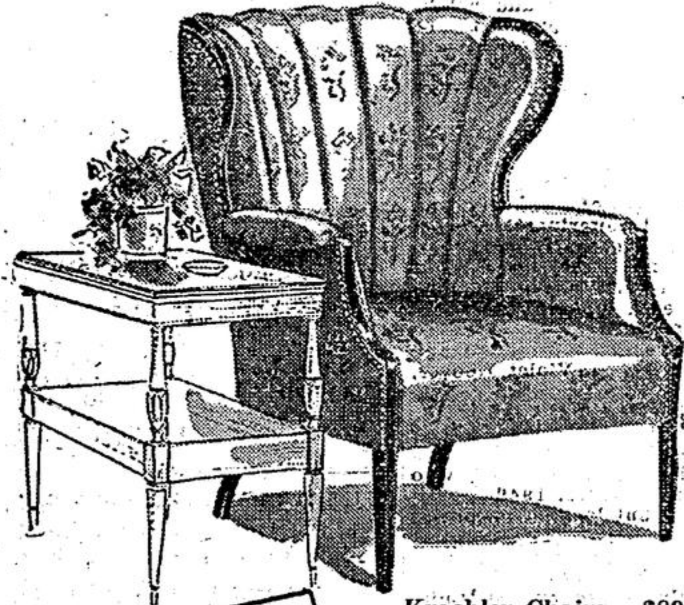
Kroehler Chairs - $89.50 Bedroom Chairs - $15.00

Occasional and various other models - $15.00 up