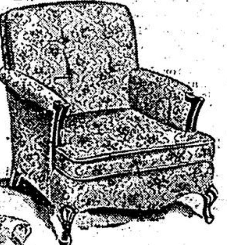
Luxurious Lounge Chair that will be appreciated throughout the year. In finer fabrics.

With a Provincial Feeling, this chair "belongs" in the more formal room. A wonderful gift indeed.