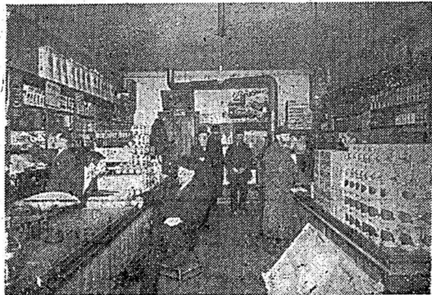
"The Pantry" about 1900