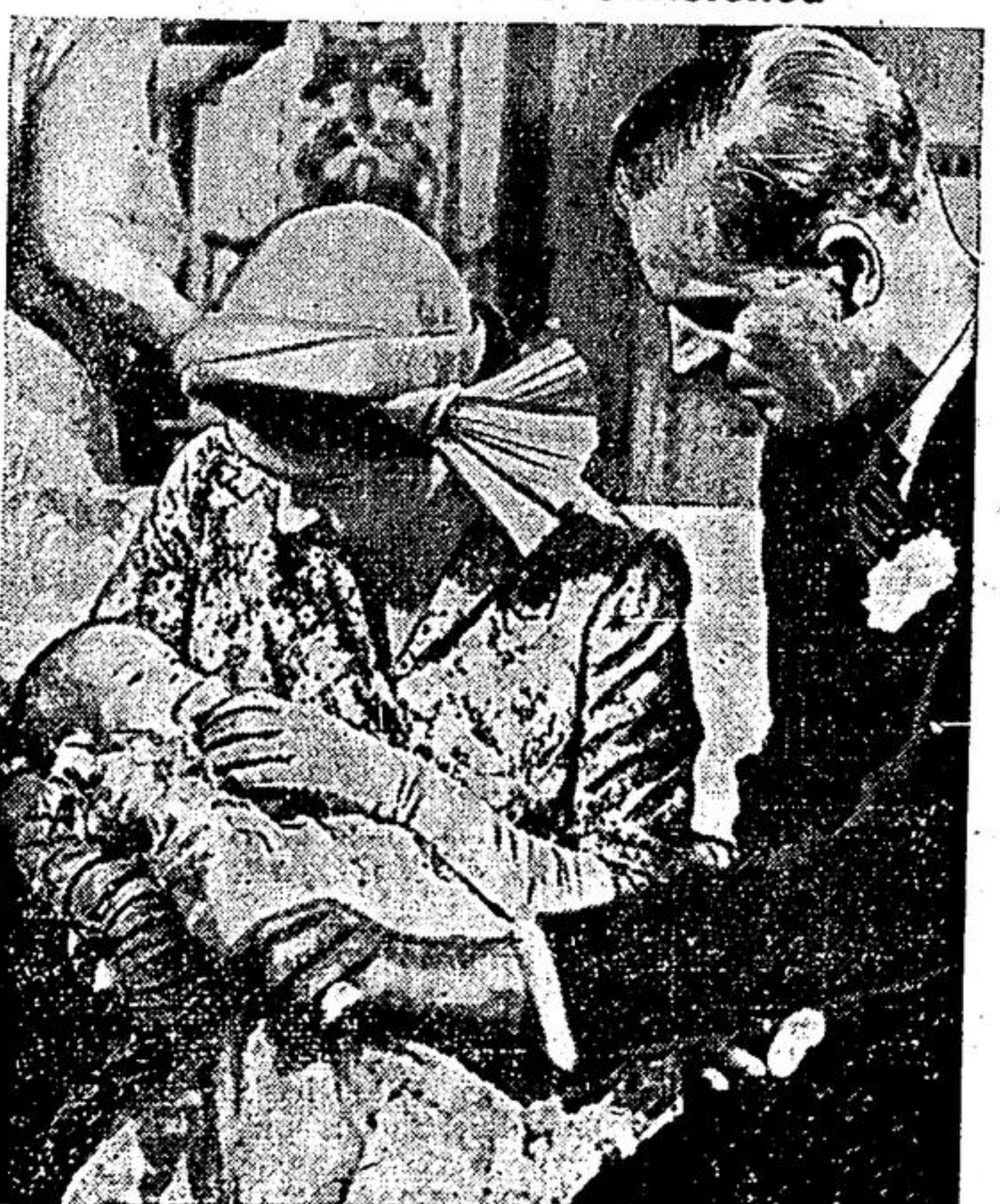
Third in line of succession to the British throne, the two-months-old daughter of Princess Elizabeth and the Duke of Edinburgh is fondly admired by both parents after she was christened Anne Elizabeth Alice Louise at Buckingham Palace. Prince Philip flew to London from Malta, for the colorful ceremony at the palace.