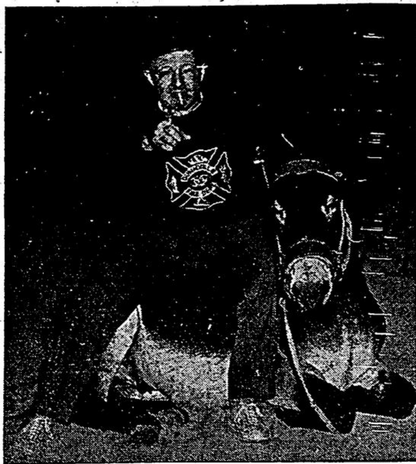
What would you do? This is a member of the Dunnville Fire Department during a vexing moment when his mount goes on strike in a Donkey