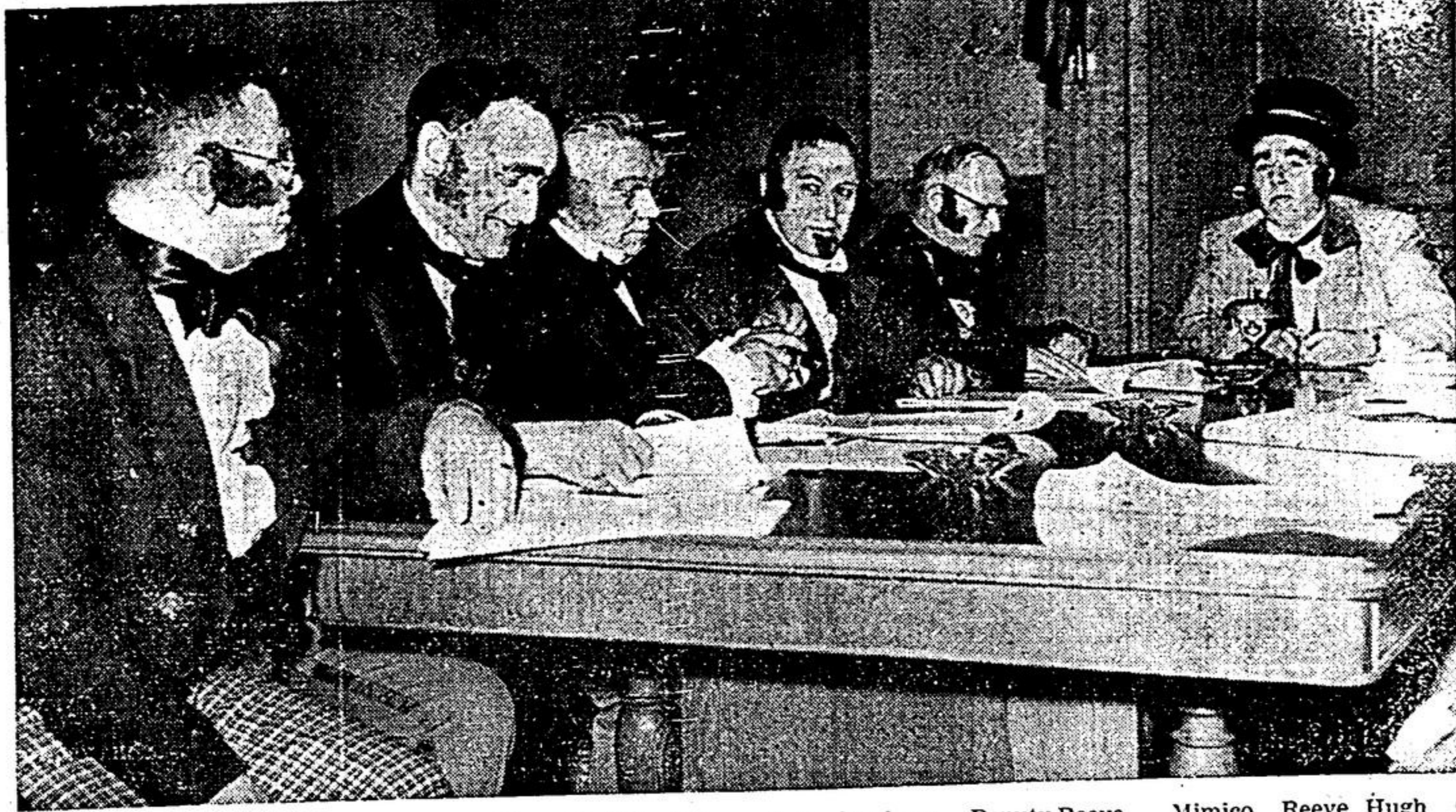
In appropriate costume, members of York County Council held 100th anniversary meeting last week. Presiding

You may ask, who pays for IRO? The answer is, you do, as a taxpayer of one of the member nations. And how is your money being spent? In the early days, mostly in care and maintenance, transport, the provision of food, clothing, amenities, accommodation stores such as beds, chairs, tables and blankets, in medical supplies and the upkeep of camps and buildings. Education had to go on, schools and even universities were founded, and vocational training and agricultural schools were established. An unrelenting search found by the DPs to annoy the