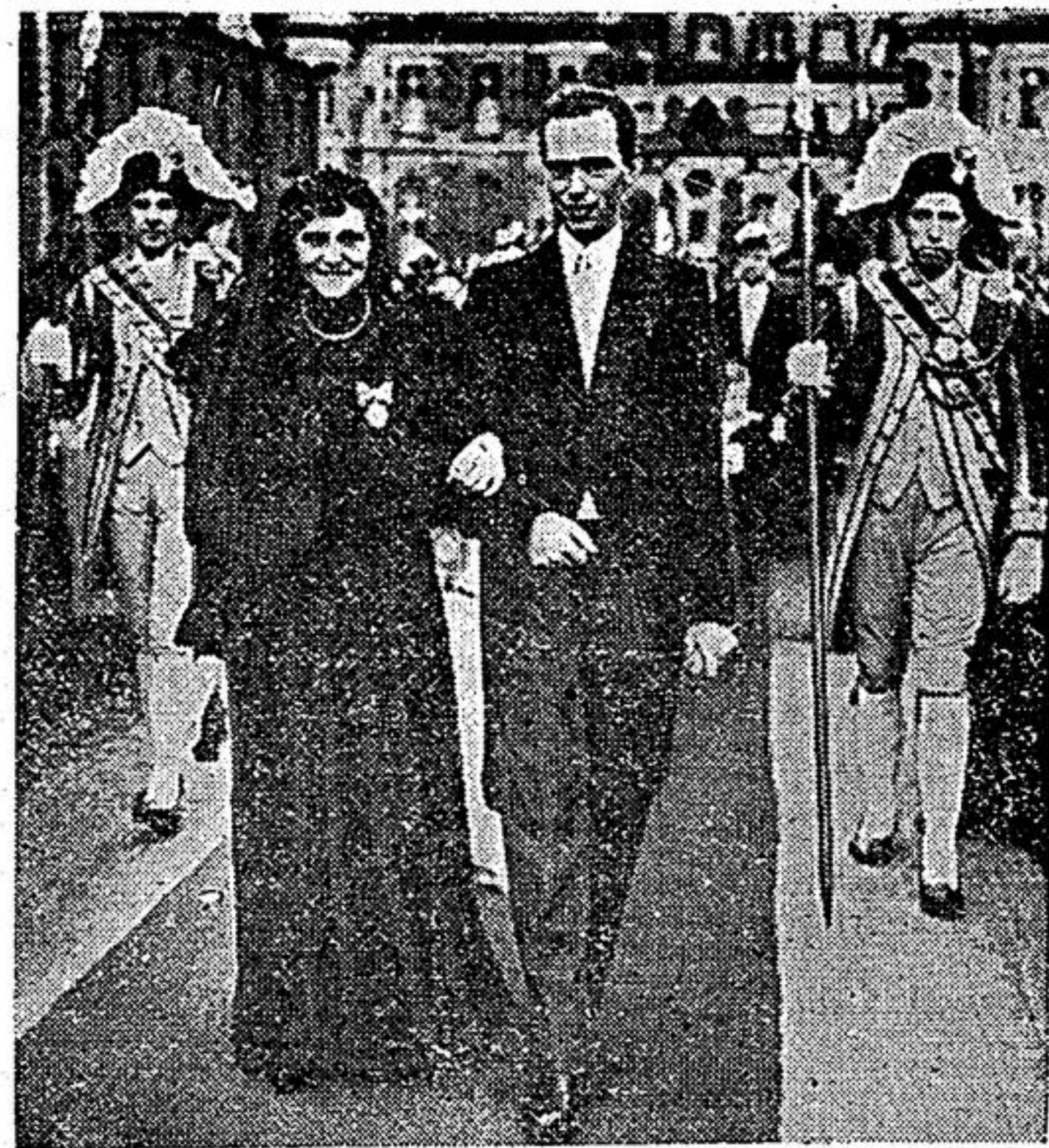
Archduke Charles of Hapsburg, fifth son of the late Emperor Charles of Austria, is shown with his mother, Empress of Austria, as they arrived for his wedding, with all the trappings of old world