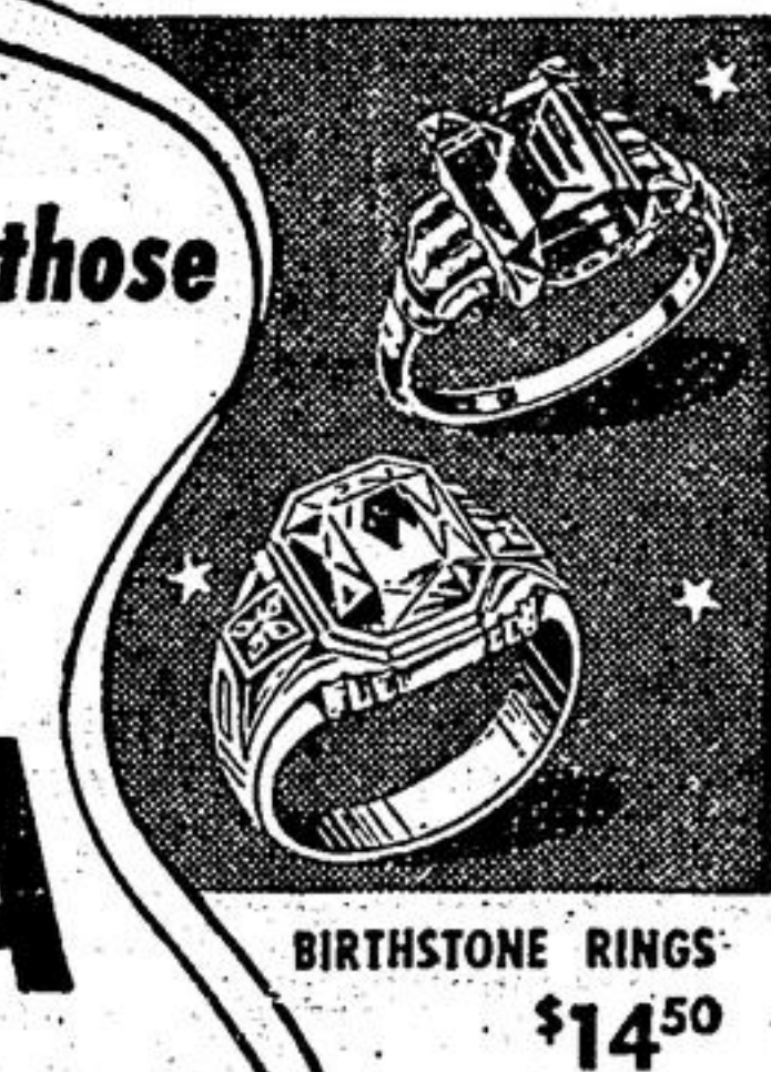
BIRTHSTONE RINGS $1450