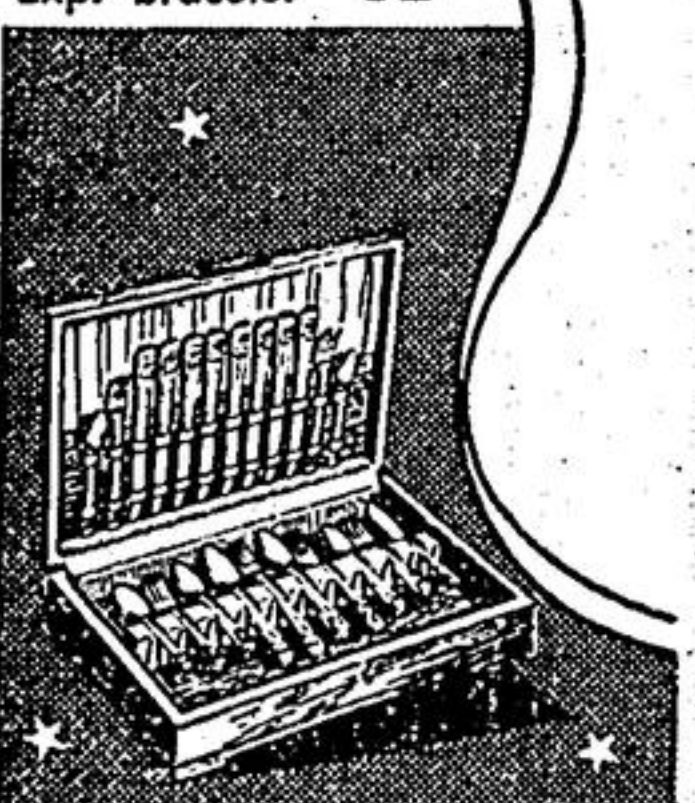
LOVELY SILVERPLATE America's Favorite Patterns $2975

"We're heading for those Big BULOVA Buys at