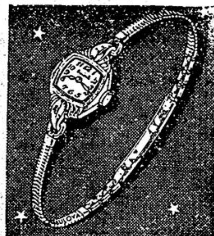
MISS AMERICA 17 Jewels Snake chain bracelet $3750