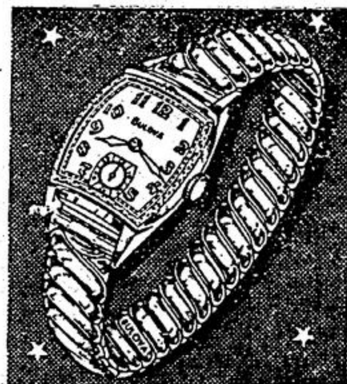
ALDERMAN 17 jewels $4250