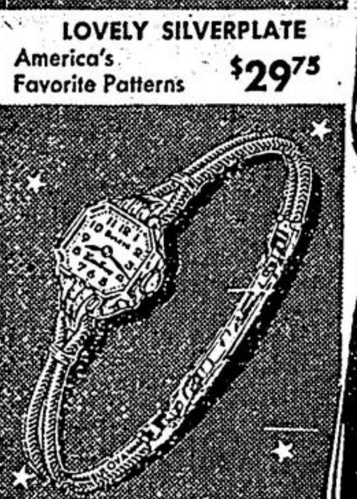
HER EXCELLENCY "A" 21 Jewels $4950