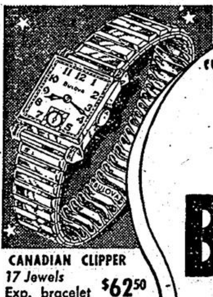
CANADIAN CLIPPER 17 Jewels Exp. bracelet $6250

"We're heading for those Big BULOVA Buys at