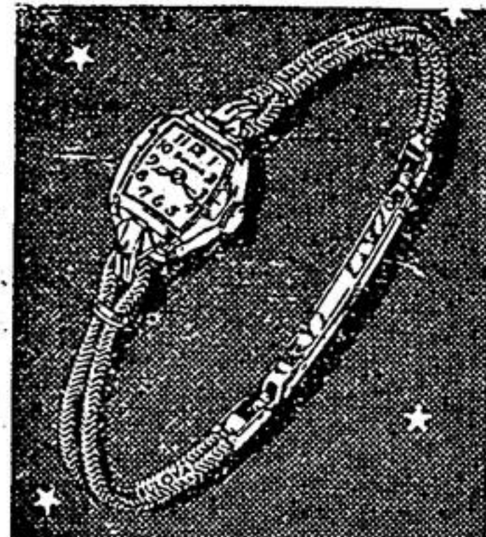
Lovely MISS LIBERTY 17 jewels $3975