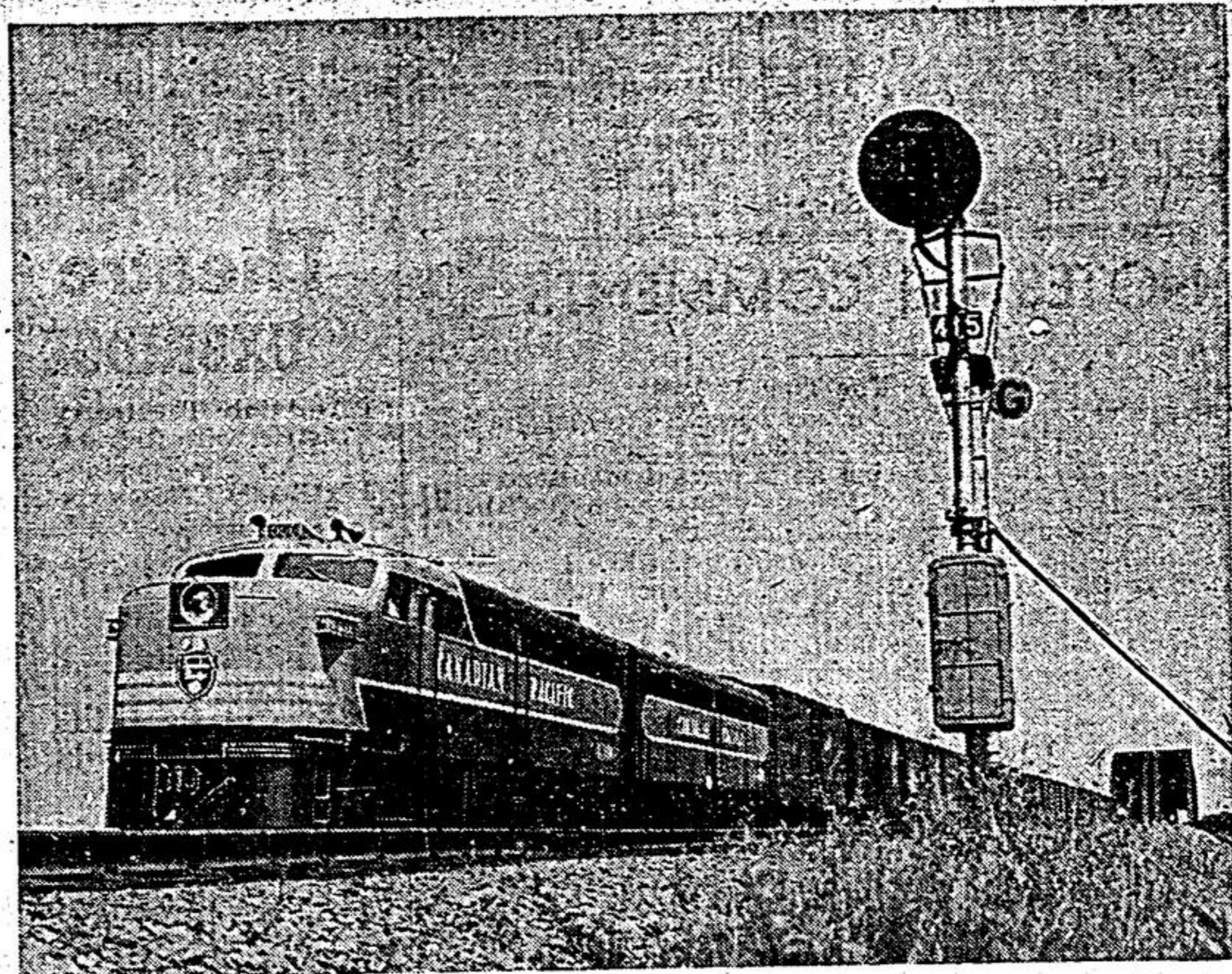
Just over the St. Lawrence River on its way from Montreal to Newport, Vt., is diesel engine 4000, first of 23 diesel units ordered by the Canadian Pacific for their main line operation from Montreal to Wells

Original street lights were fiber torches.