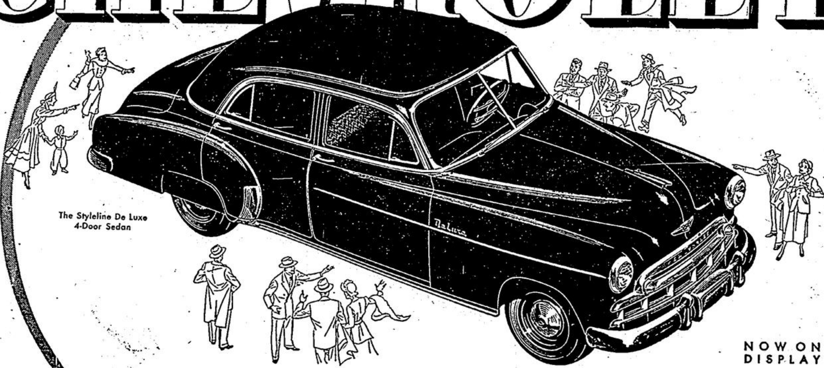
The Styleline De Luxe 4-Door Sedan