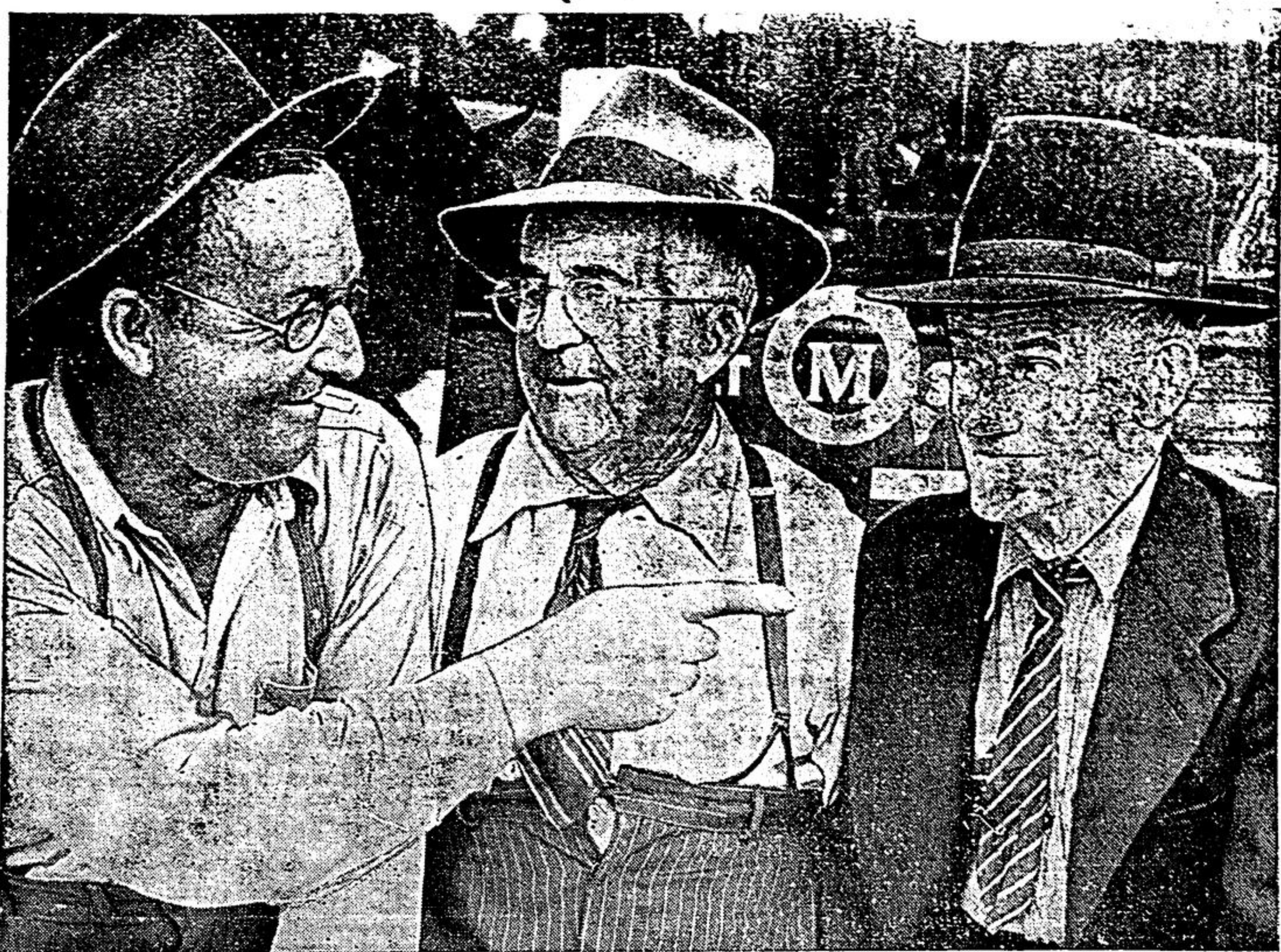
Hotter than a hot stove is this discussion of the vote in Port Perry in which the "drys"

last week overwhelmingly defeated proposals for the establishment of a brewer's ware-