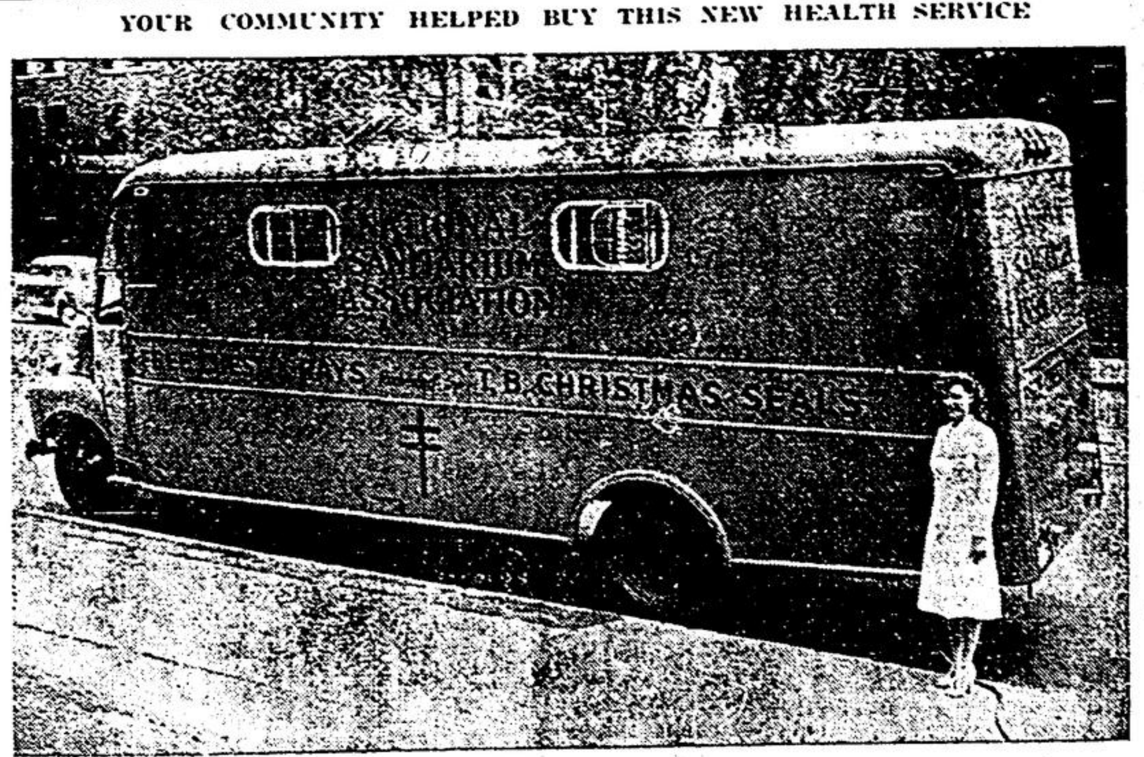
Bought with funds raised through the sale of T.B. Christmas Seals, this new mobile chest x-ray clinic will tour York and Simcoe counties and the

drive to Toronto, but the Toronto which he had been directed by his company is a small town in Southern Ohio—a town he had never heard of. He plans to break records back to Ohio.