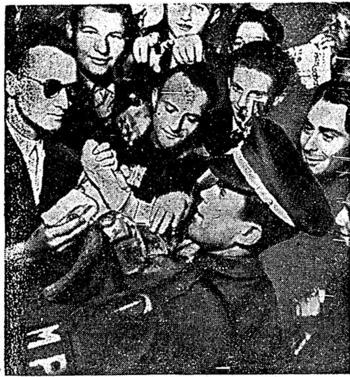
A U.S. M.P. has his hands full trying to hold back Germans in Frankfurt as they sought to buy goods in a store before the deadline set for the issuance of new currency. The Allied-an-

nouncement that new money would be put into circulation to fit German economy into the recovery program prompted the stampede.