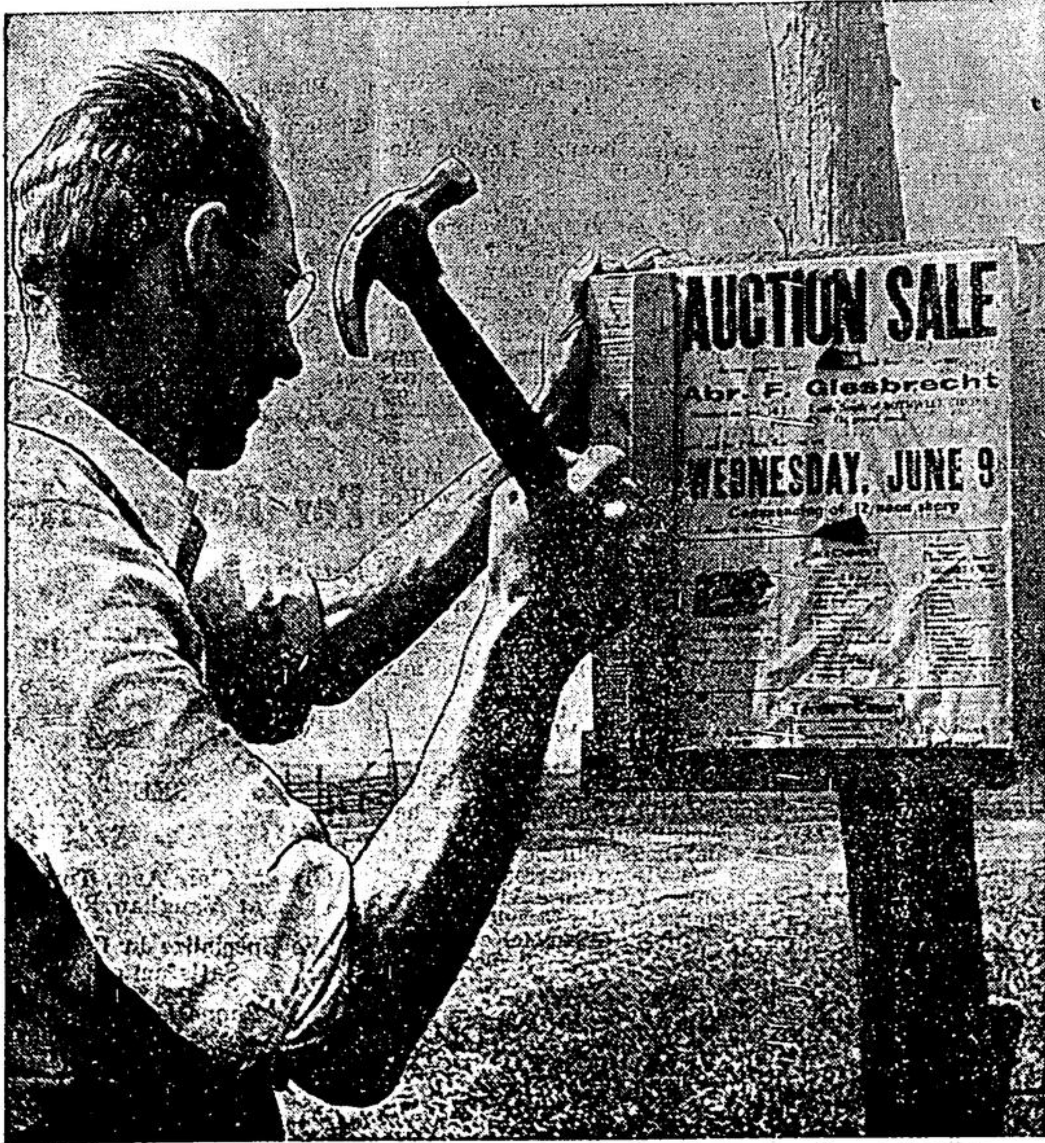
PARAGUAY is the Promised Land to 1,600 Manitoba Mennonites, as they prepare to leave their communities for a

"growing antagonism" toward pacifist views which brought persecution to forebearers.