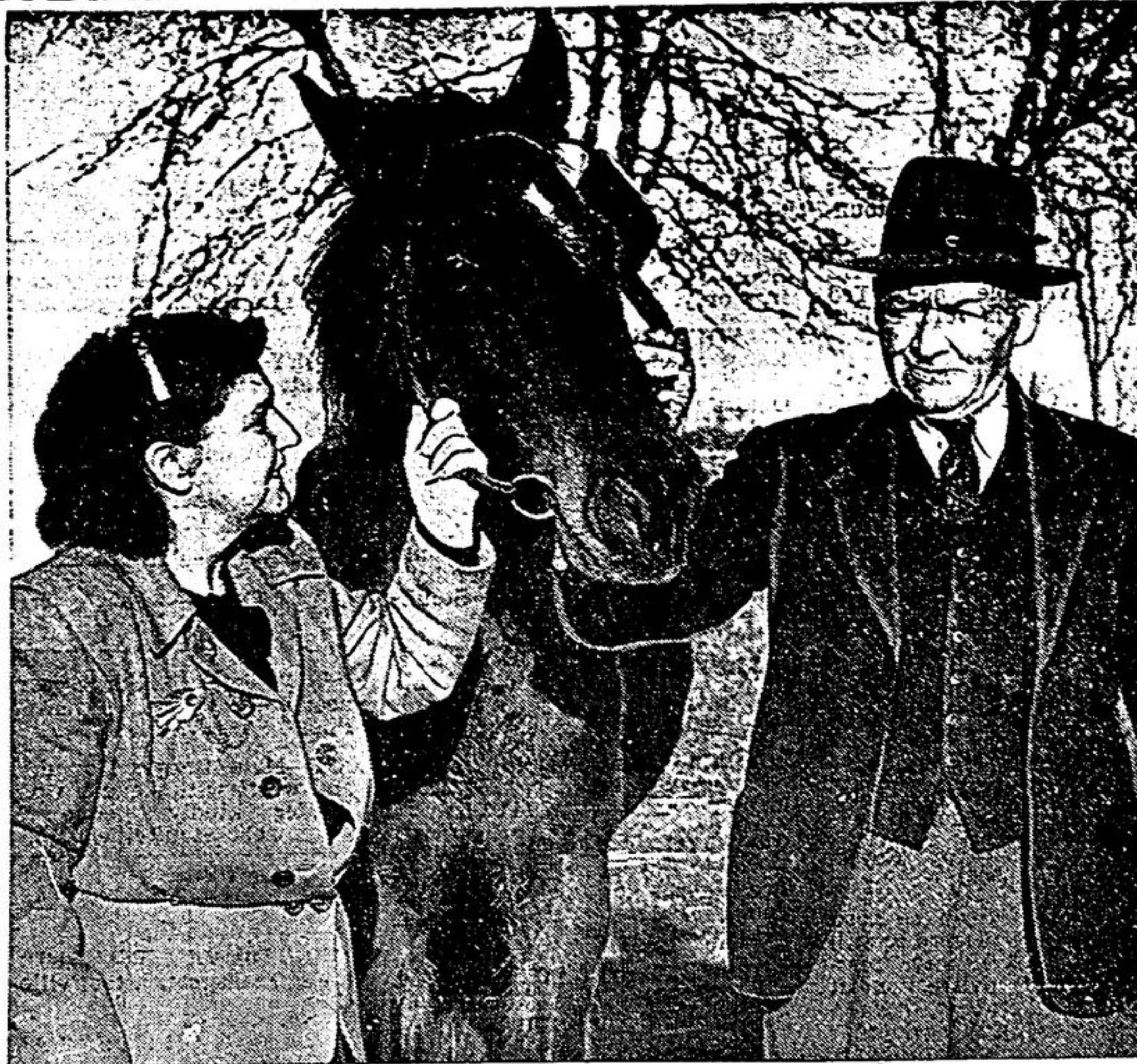
Dick, the faithful horse, as one of His Majesty's humber servants, has plodded some