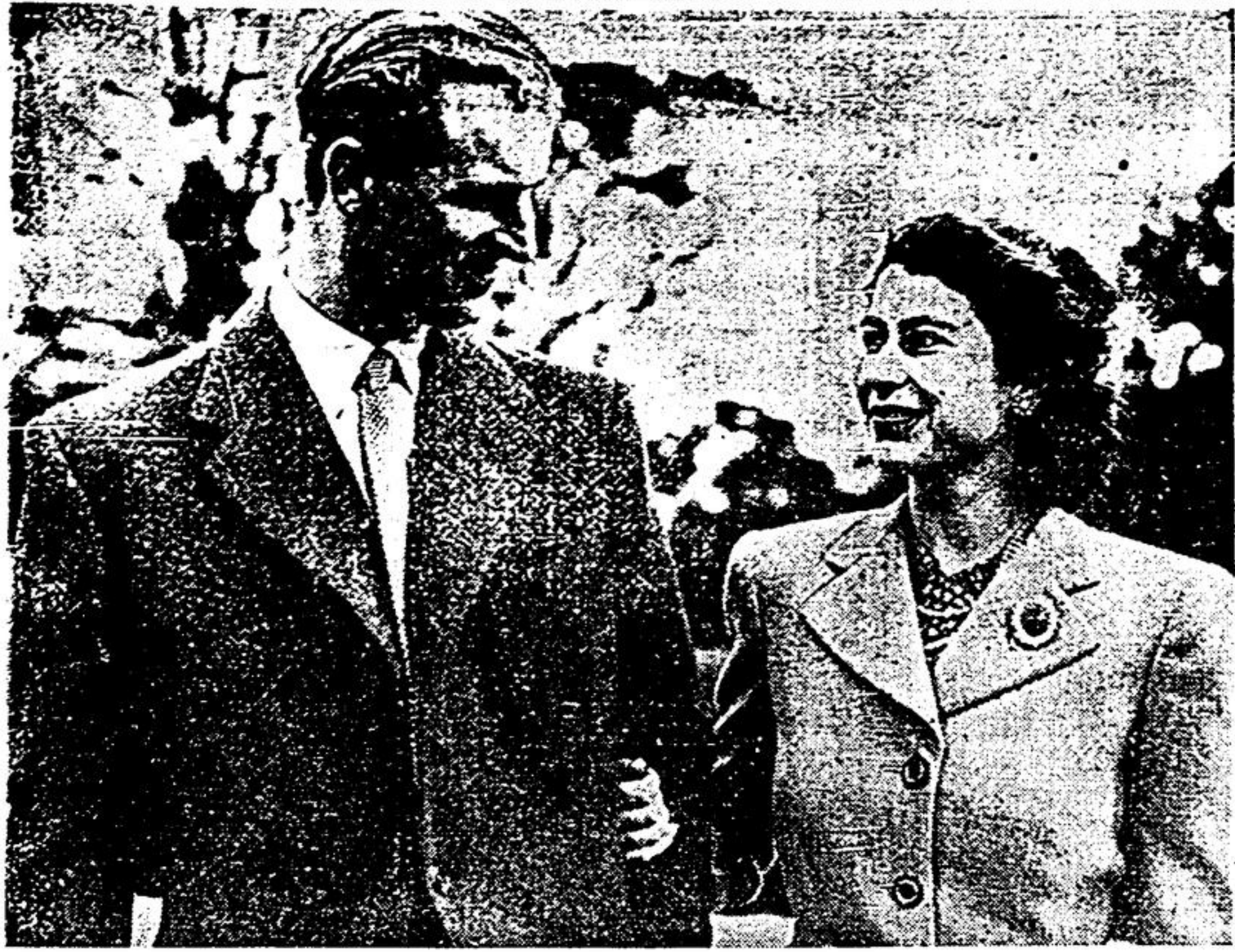
Princess Elizabeth, heiress-presumptive to the British throne, and her husband, Prince Philip,