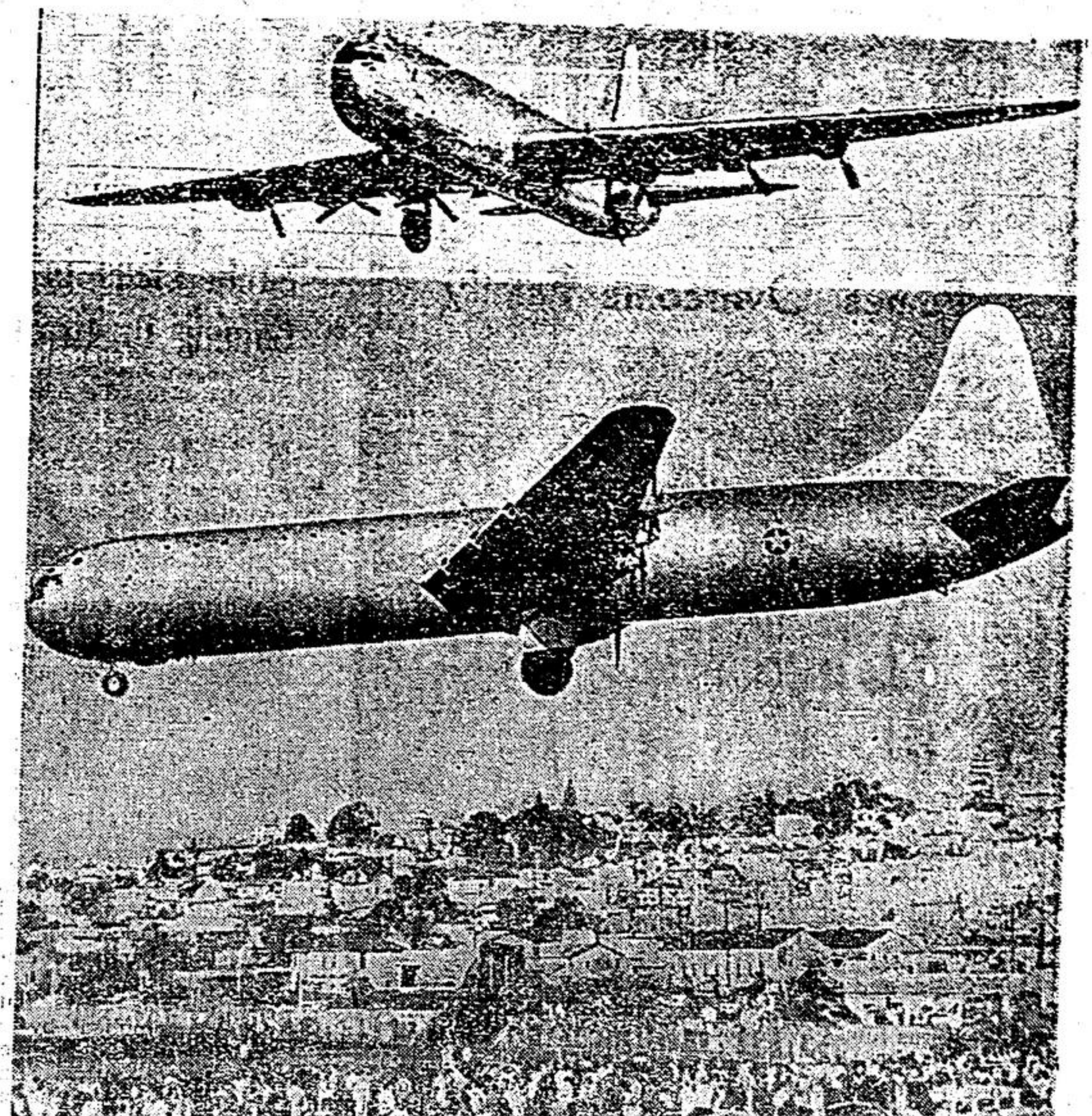
The world's largest land plane, the $15,000,000 experimental XC-99, is shown in the air (top) during its first successful one-hour test flight. Bottom, the pride of the U.S. Air Force

Farm accidents and their causes are analysed in a recent report of the Dominion Bureau of Statistics dealing with non-fatal accidents on