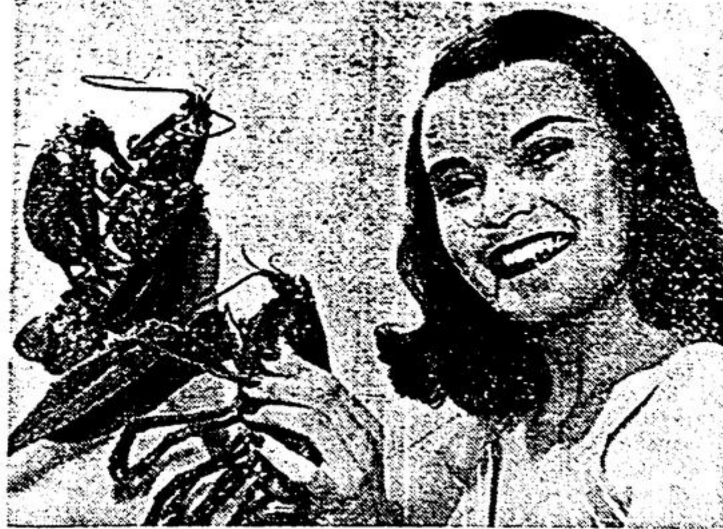
Nova Scotian lobster will be part of the royal dinner menu at the wedding of Princess Elizabeth and Philip Mountbatten. The lobsters selected for the event are now being held in captivity in a lobster farm at St. Andrews, N.B.