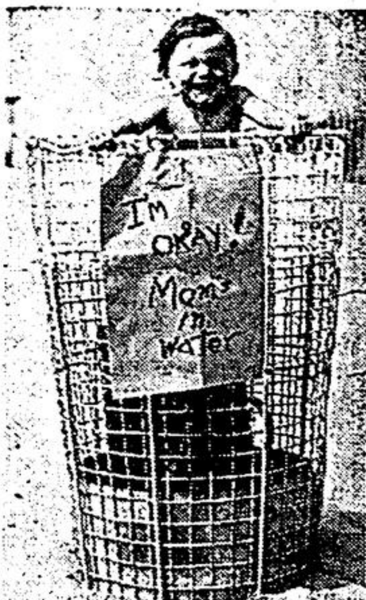
As Mother Swims

Summer is the best time to carry out cleaning* and repairs of the heating system in the home