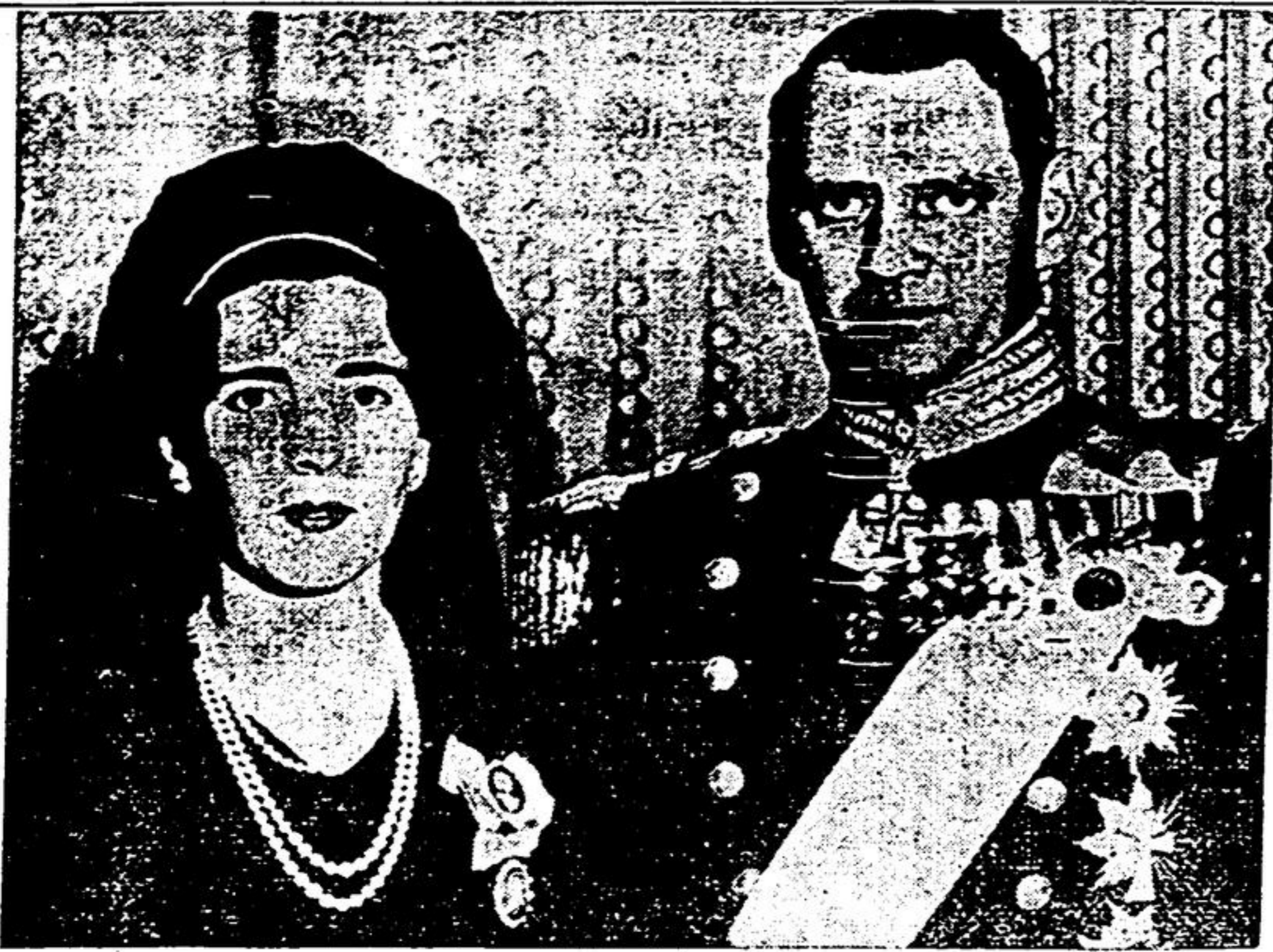
New King and Queen of Denmark are seen in this formal portrait taken at Christianborg