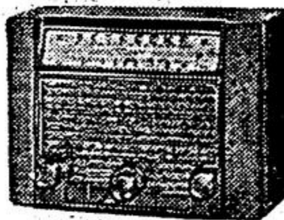
MARCONI MODEL 217 S.W.

Check on our trade-in allowance before you buy.