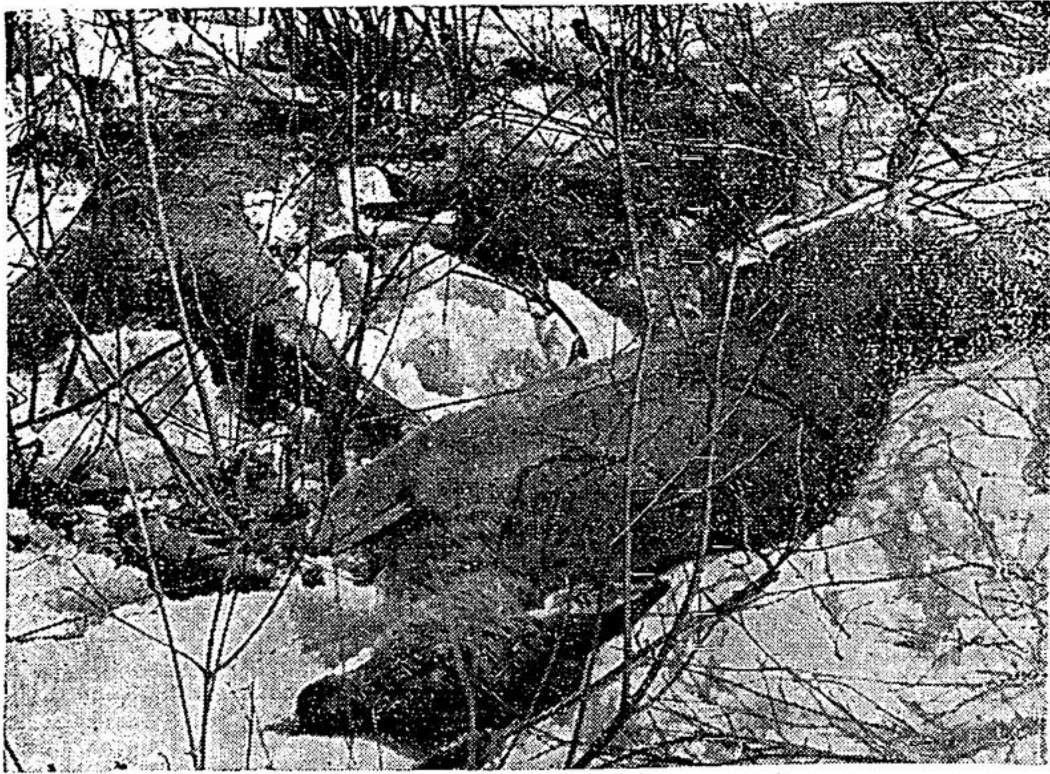
Heavy toll of wild life taken by wolves is indicated by this picture, depicting three slain

Alaska highway. His dog and her three pups are passengers.