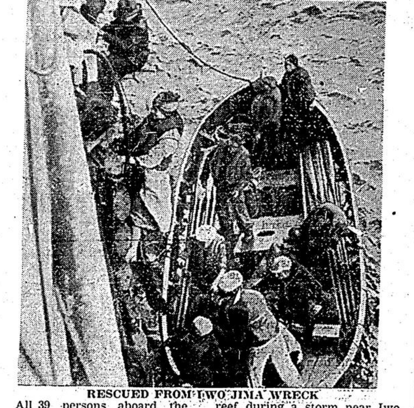
RESCUED FROM IWO JIMA WRECK All 39 persons aboard the freighter Lake Sapor were saved after the ship struck a reef during a storm near Iwo Jima. Crew members are seen aboard the rescue ship.