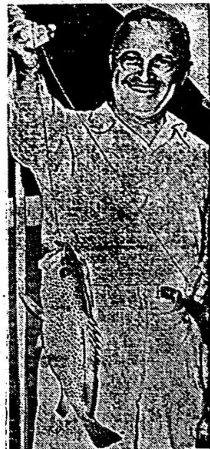
Big fish he caught during vacation in Bermuda is proudly displayed by President Truman. The fish is a hind.