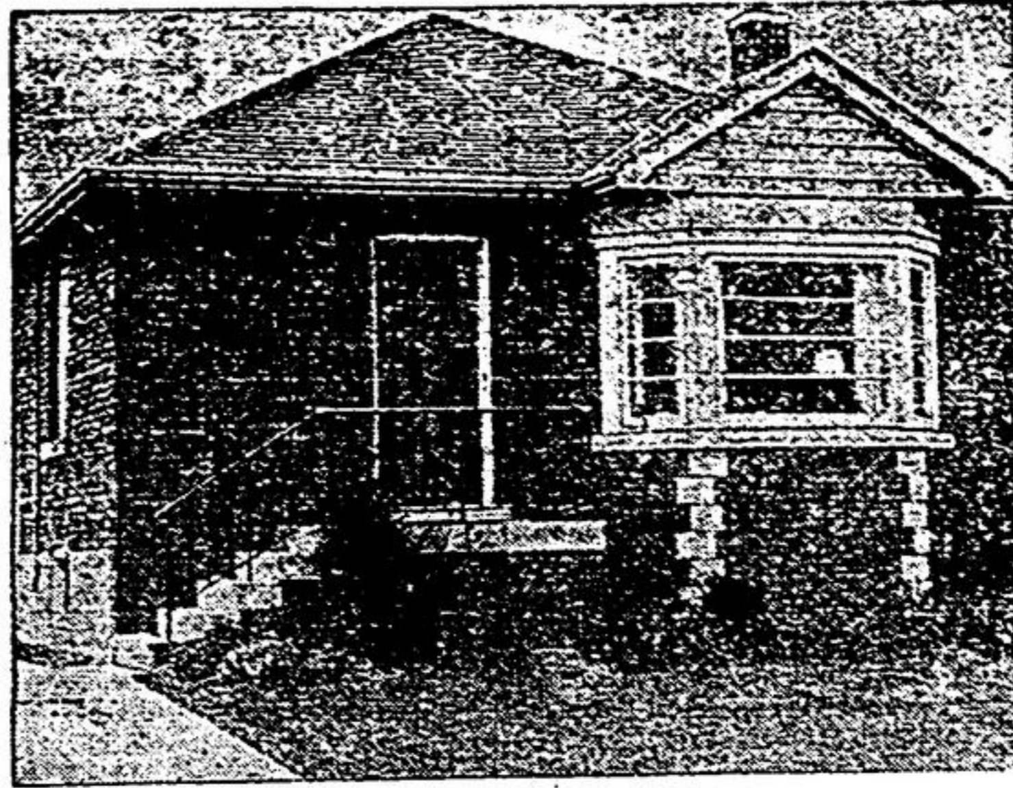
Permanent Brick House, with basement and furnace, being built by private contractors in Hamilton for ex-servicemen for $3,890. This is a 200-house project.